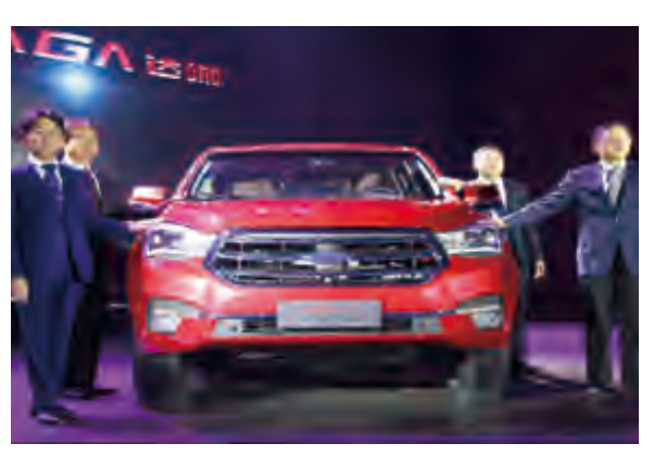
2017年12月T∧G∧皮卡上市 Launch of T∧G∧ pick-up truck in December 2017