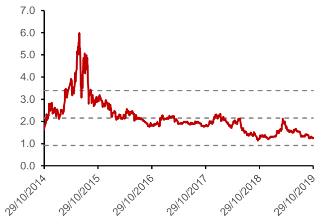
Figure 3: Historical P/B