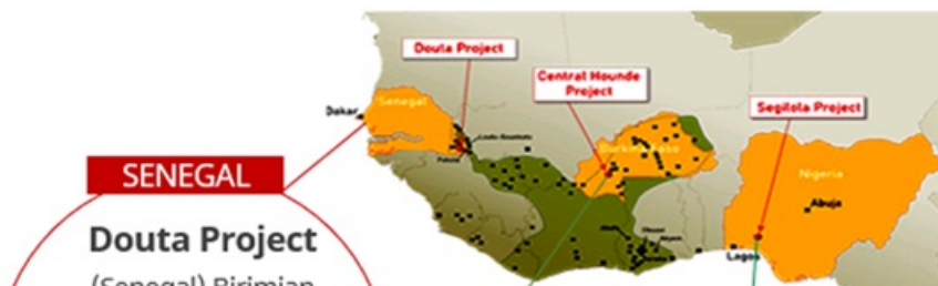
Figure 1.1: Thor's Properties in West Africa

Our strategy is to operate, develop and explore mineral properties where our expertise can substantially increase shareholder value. The Company operates with transparency and in accordance with international best practices and is committed to delivering value to its shareholders through responsible development, providing economic and social benefit to our host communities and operating in a manner where health and safety and the environment are integral to our operations and development approach.