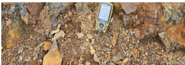
Figure 4: Outcrop of newly exposed banded iron formation (BIF) grading 34.3% Fe and 0.19 g/t Au.