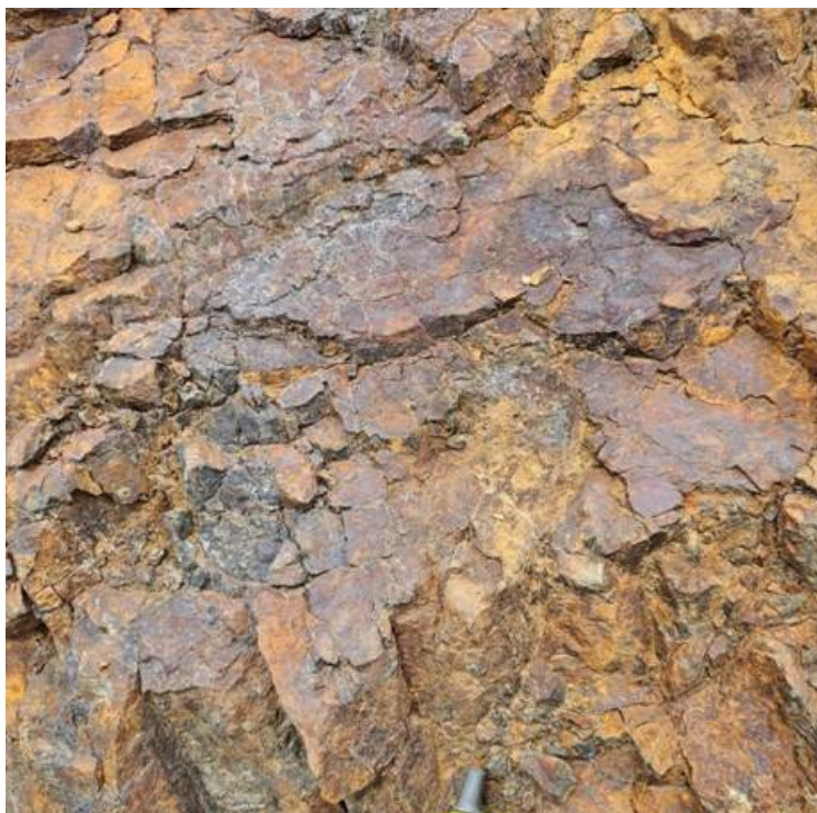
Figure 3: Newly exposed sulphide outcrop grading 0.91 g/t gold.

Prospecting will also continue along trend towards the Gorm Lochs Prospect which lies 10 kilometres south of the Kerry Road deposit. Historical samples collected at the Gorm Lochs include up to 4 g/t Au in outcrop (see Galantas' news release dated January 26, 2023).