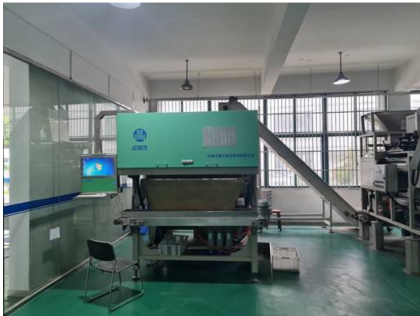
Figure 1. Angelon Optical sorter

Angelon Electronics Co, Ltd was founded in 2001 and has been granted more than 20 patents in the image acquisition field. They are listed on the Chinese NEEQ stock market, with a stock code 838092. Their machines have been exported to companies in south-east Asia, USA, Canada, Brazil, Peru, Britain, France, Spain, Turkey, Latvia, Czech Republic, South Korea, Japan, Guatemala, India, Pakistan, Iran, Lebanon, Egypt, South Africa, Tunisia and Ethiopia. Their website can be found at: https://www.angelon.com.cn