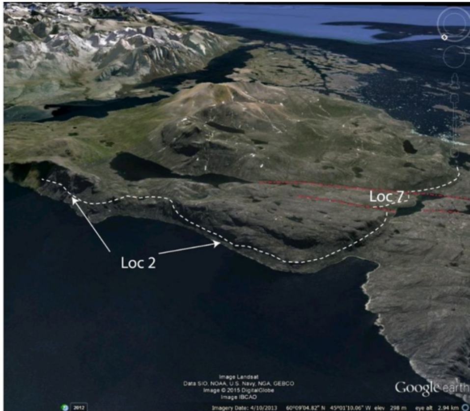
Figure 2. Known

GreenRoc's exclusive licences MEL 2013-06 (including the Amitsoq deposit) and MEL 2022-03 and the newly applied for area in light green (which will form part of MEL 2022-03 upon grant). The red symbols mark the known occurrences of graphite mineralisation.