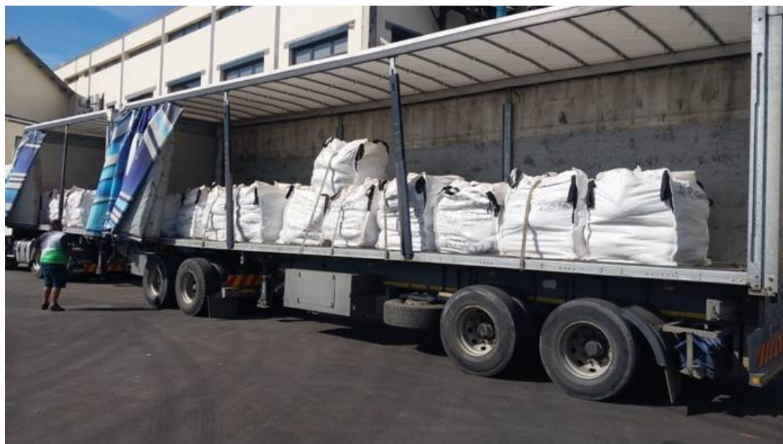
Figure 2: Kasiya 30-tonne sample received at Paterson & Cook

Following completion of the Pre-feasibility Study ( PFS ), the Company commenced a study optimisation phase and will then advance to the Definitive Feasibility Study ( DFS ). The material is representative of ore expected to be mined in the first ten years of production and will be used for advanced bulk laboratory scale test work to optimise technical elements from the PFS as part of the study optimisation phase. Areas of focus include larger-scale pumping, tailings characteristics and dewatering.