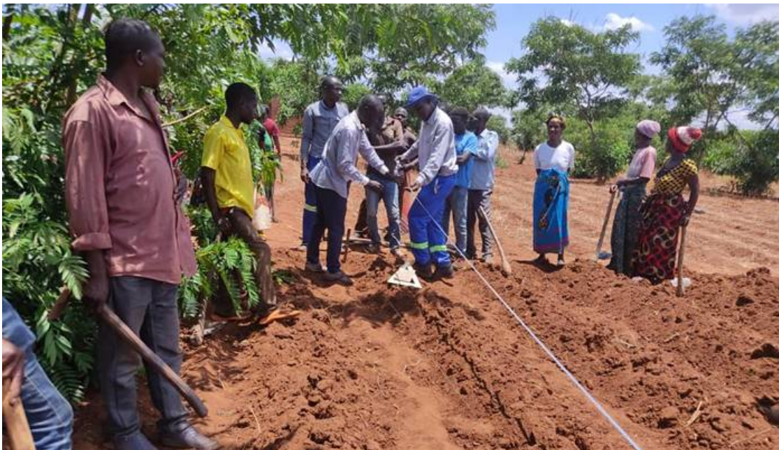
Figure 4. Sovereign team members conducting conservation farming training

Malawi's food security depends on maize (corn); it is the major staple food crop in Malawi with 60% of cropped land devoted to its production. Sovereign has commissioned the initial Program for 90 Malawian maize farmers from within the project area, of which at least 50% are female. The Program is to provide training in low-input-cost, high-yield sustainable farming techniques, with the aim to provide a platform where successful smallholder farmers can produce sufficient surplus crops to generate sustainable household income.