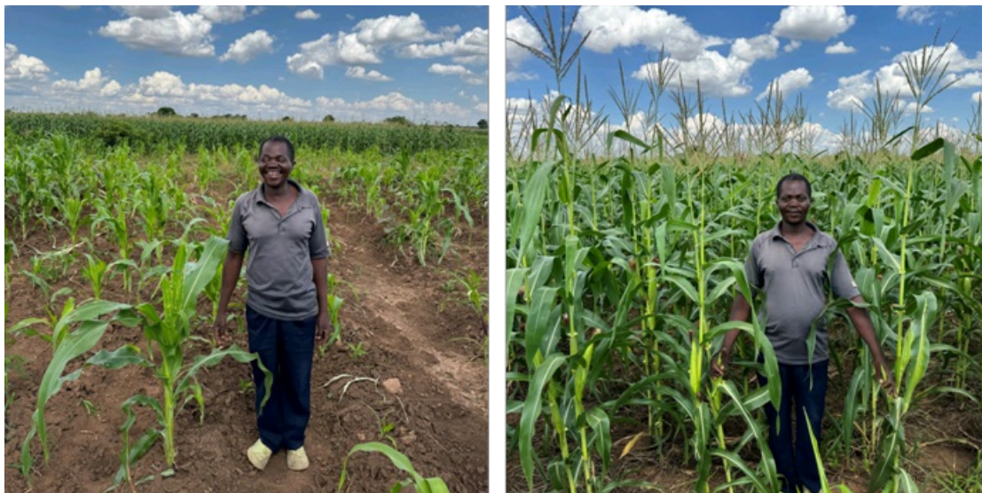
Figures 5 & 6 - Left: planted field using traditional techniques & Right: Field farmed under the Program showing substantially more crop growth

Increases in maize (corn) production will be quantified in the coming months during the harvest season. Farmers participating in the Program expect to begin harvesting in May 2024, and are looking forward to a bumper harvest, despite the much drier than usual year caused by El Niño, causing widespread drought across southern Africa.