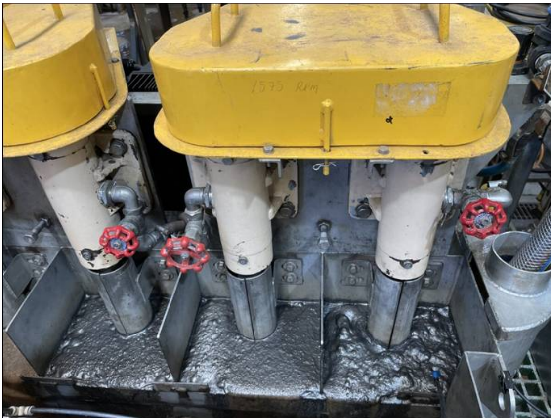
Figure 3: Graphite flotation test work at Australia-based ALS Global

Pilot-scale testwork confirmed the laboratory-scale results with >90% TGC recovery to high-grade graphite concentrates (<180-micron concentrate at 96.9% TGC and >180-micron concentrate at 97.2% TGC).