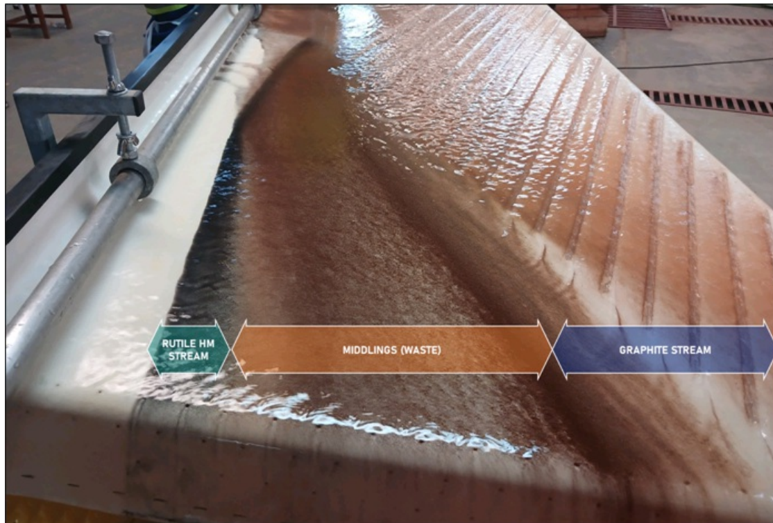
Figure 1: Holman Wilfley 2000 wet shaking table in action demonstrating clear separation between Rutile HM, waste and Graphite

The graphite circuit feed provided to the various laboratories was produced at the Company's existing laboratory facility in Lilongwe, Malawi, where it was screened and separated over a wet shaking table.