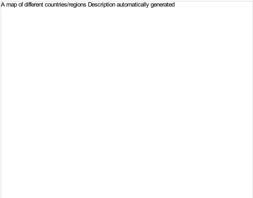
Figure 4. Guinea Geology and Project Locations

A map of different countries/regions Description automatically generated