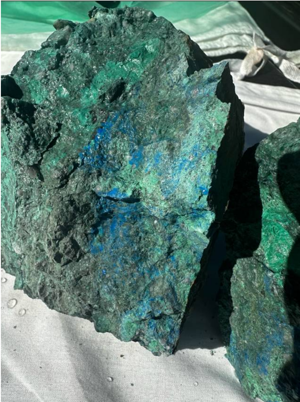
Figure 1: Photo of rich copper oxide sample taken from historical trench next to historical shaft at Blue Rock. Sample OBR002 assayed 12.34% Copper.

Oracle Power PLC (AIM: ORCP) is a global project development company dedicated to maximising returns through strategic development and international collaborations. Its diverse portfolio includes pioneering energy and resource projects such as a Green Hydrogen and Renewable Power initiative in Pakistan, as well as the Northern Zone Gold Project and Blue Rock Valley Copper and Silver Project in Australia.