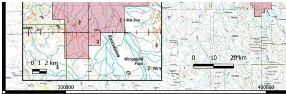
Figure 3: Blue Rock Valley project location and access

This information is provided by RNS, the news service of the London Stock Exchange. RNS is approved by the Financial Conduct Authority to act as a Primary Information Provider in the United Kingdom. Terms and conditions relating to the use and distribution of this information may apply. For further information, please contact ms@seg.com or visit www.ms.com .