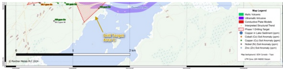
Figure 1: Dotted Lake Phase 1 Drill Target Areas