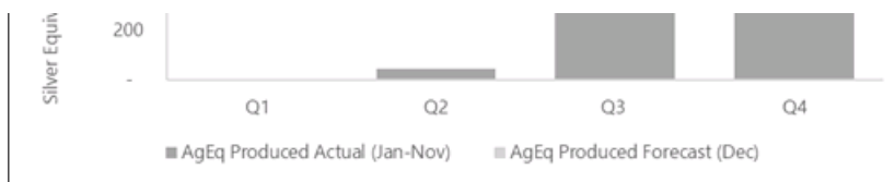
Figure 2: YTD Silver Equivalent Contained Metal Production by Quarter

* Silver equivalent (AgEq) assumes 25/oz Ag, 2,000/oz Au, 2,500/t Zn, 2,000/t Pb, 6,500/t Cu, 6,500/t Sb as per the July 2023 Mineral Resource estimate