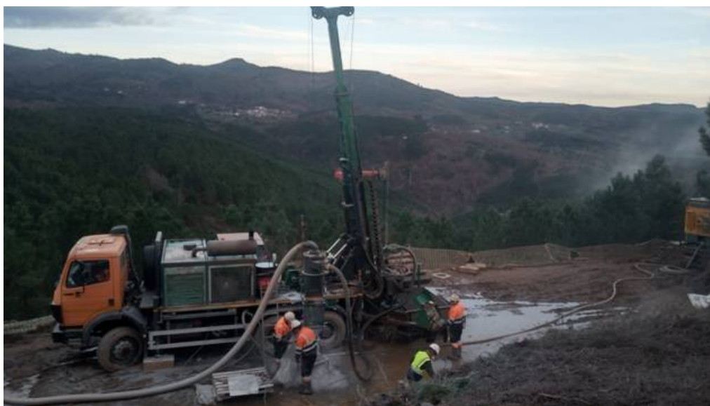
Figure 1. Drilling underway at Reservatório