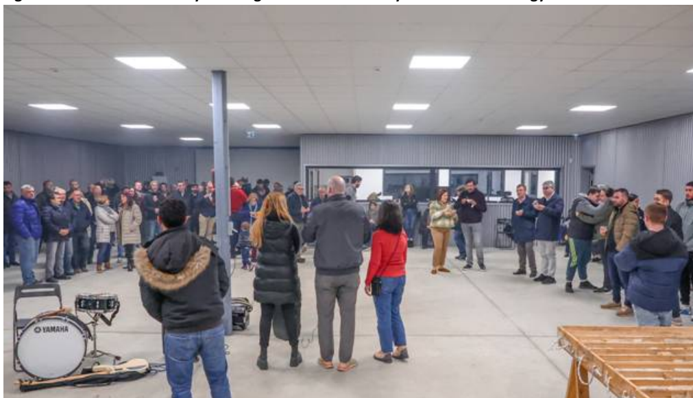
Figure 4. A recent community meeting in Savannah's newly refurbished Geology Centre