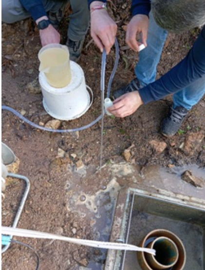
Figure 2. Ground and surface water sampling as part of RECAPE studies