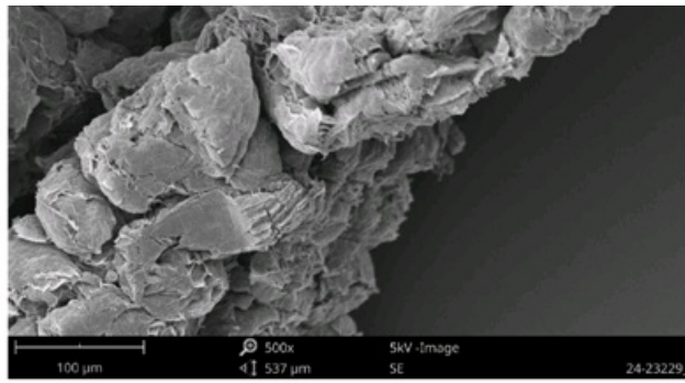
Figure 2: Scanning Electron Microscopy (SEM) of optimised expanded graphite, achieving 650cm 3 /g expansion volume.