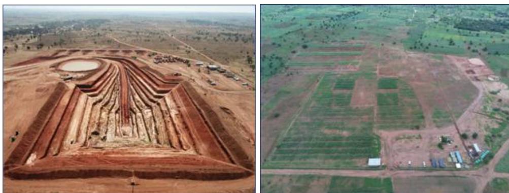
Figure 2: Pilot Phase test pit during mining trials (left) and subsequently backfilled and rehabilitated (right)