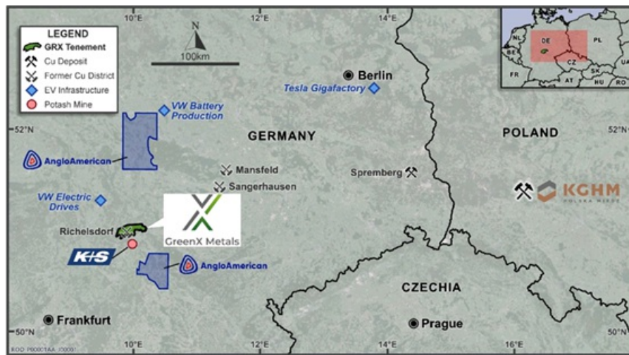
Figure 1: Tannenberg is located in the industrial centre of Europe

It is expected GreenX's participation in Xplor will expedite the build-out of geological concepts and the exploration timeframe at Tannenberg. GreenX intends to use the grant to conduct geophysics programs over the Tannenberg licence area.