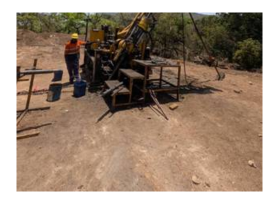
Figure 2: day-night drilling campaign at Orom-Cross