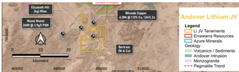
Figure 1: Andover Lithium Joint Venture Tenements

This announcement has been approved for release by the Board of Artemis Resources Limited.