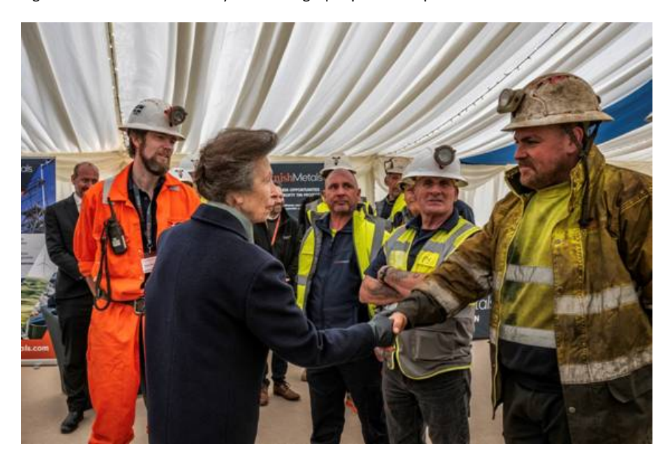
Figure 3: HRH The Princess Royal meets members of the Cornish Metals team \,