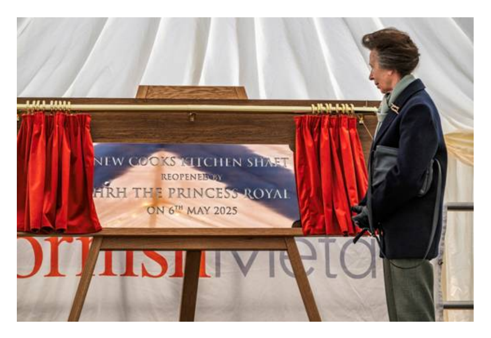
Figure 2: HRH The Princess Royal unveiling a plaque to re-open New Cook's Kitchen Shaft