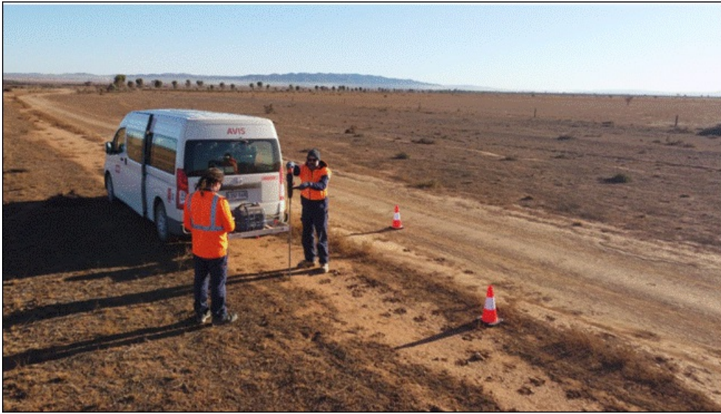
Figure 1: Field operations in the southern flinders area, collecting soil air geochemical analysis at Project HY-Range, May 2025.