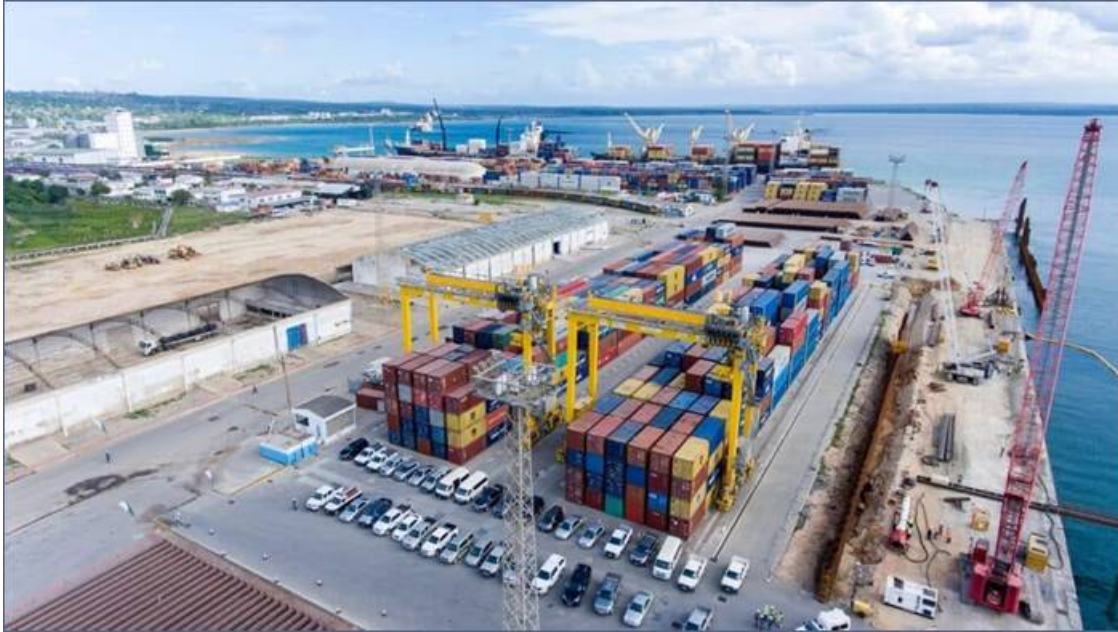
Figure 3: Nacala Port is the deepest water port in Southern Africa