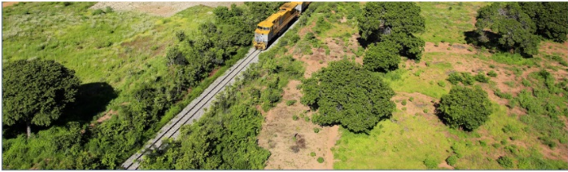
Figure 2: Bulk cargo trains operating on Nacala Corridor