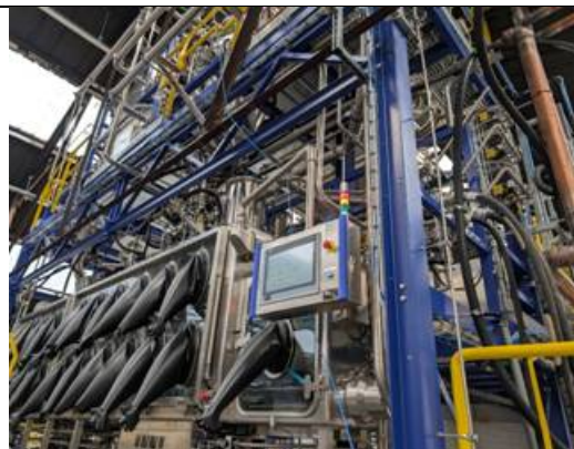
Figure 2: Powder processing plant - Tyseley Energy Park, Birmingham, UK