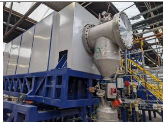
Figure 1: HPMS vessel - Tyseley Energy Park, Birmingham, UK

The Company is evaluating a phased expansion starting next year, initially to 100-350 tpa of NdFeB alloys and magnets and subsequently to 1,000 tpa.