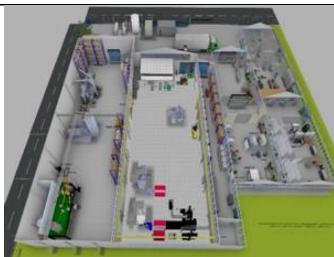
Figure 6: HyProMag Germany - layout