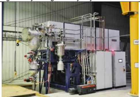
Figure 8: HyProMag Germany - installed HPMS vessel