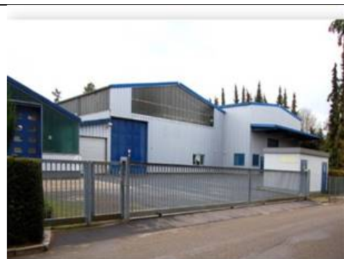
Figure 5: HyProMag Germany premises - Pforzheim

HyProMag Germany is evaluating expansion options to 750 tonnes per year from the currently planned 100-350 tpa - an updated 3D fly through for the conceptual design can be accessed via the following link: https://youtu.be/HfAY3YImPg0