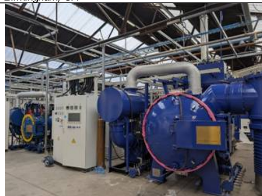
Figure 3: 50kg and 400kg sintering furnaces at Tyseley Energy Park, Birmingham, UK