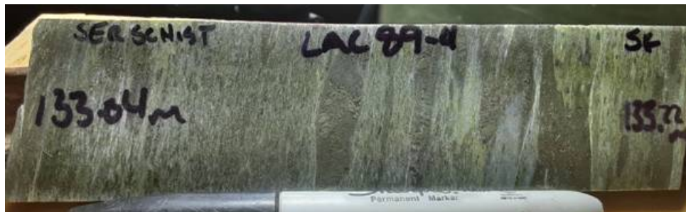
Figure 4: 1989 drill core segment from Loflin displaying sheared sulphides housed in a foliated tuff.