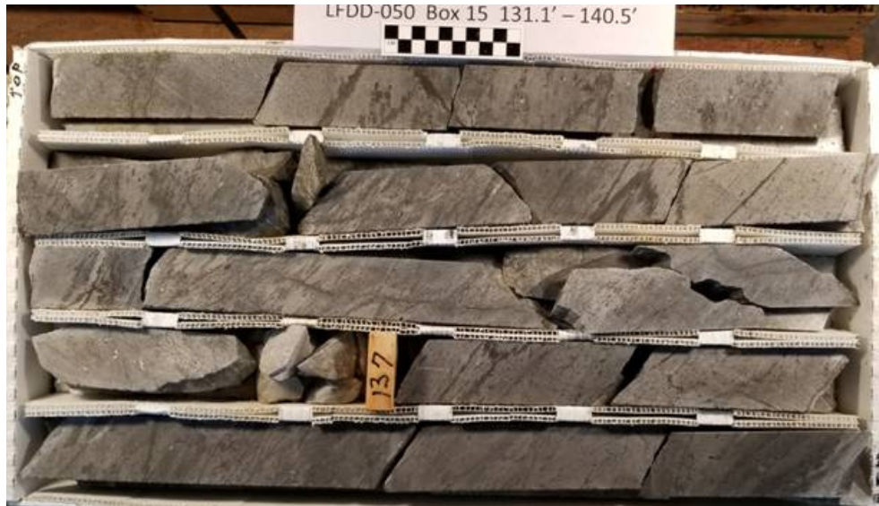
Figure 3: 2021 drill core from Loflin displaying a phyllic altered and deformed volcanoclastic. Note that the core block measurement is in feet.

The Jones Keystone and Loflin deposits were classified as mesozonal orogenic gold by the North Carolina Geologic survey in 2018. These deposits formed along deformation zones that have been subjected to pervasive sulphidation.