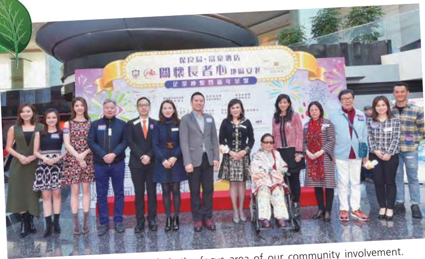
Supporting the aged and elderly is the focus area of our community involvement. 關愛老年人為我們於社區參與的一環。