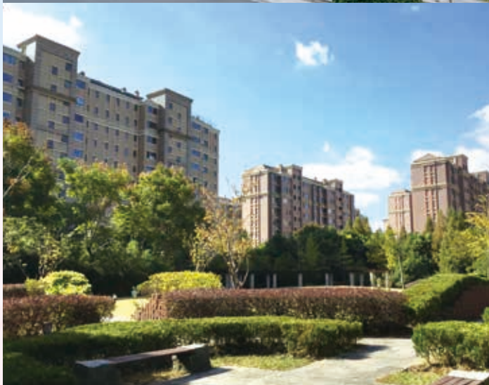
Zhangjiang Tomson Garden 張江湯臣豪園