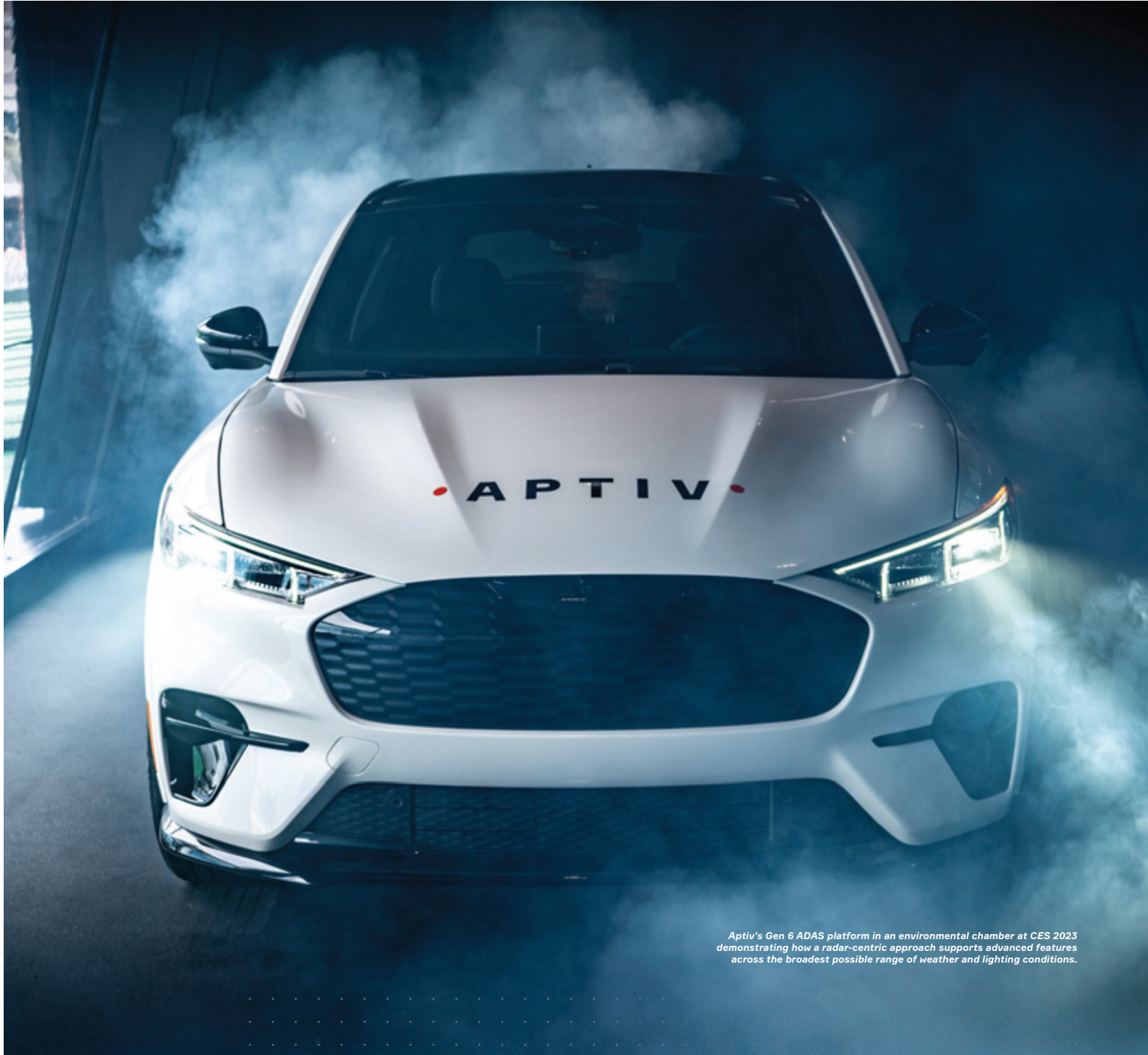
Aptiv's Gen 6 ADAS platform in an environmental chamber at CES 2023 demonstrating how a radar-centric approach supports advanced features across the broadest possible range of weather and lighting conditions.

“While we are proud of the resilient and innovative company that we have built, we are even more excited about how we are positioned for the future.”