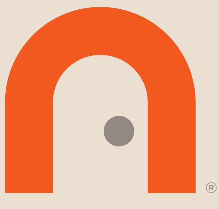
2022 FORM 10-K