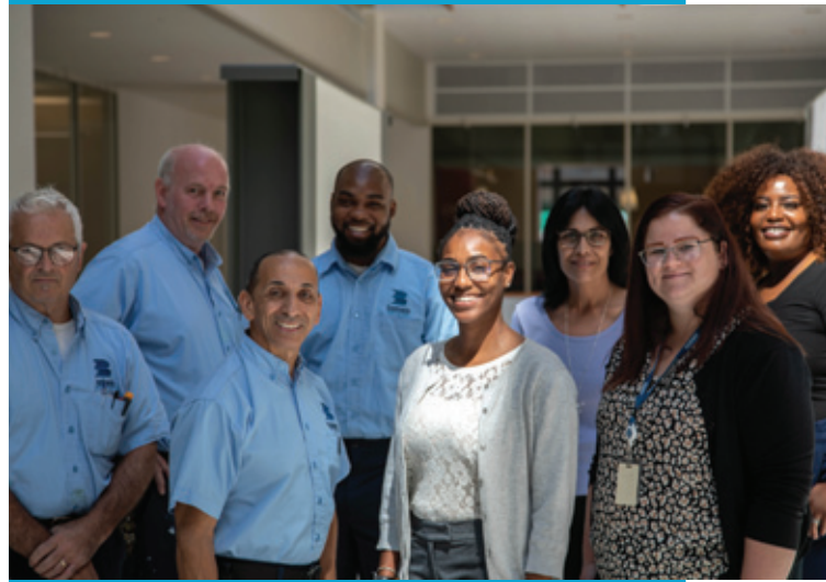
From top to bottom (L to R): Construction underway at 3025 JFK Boulevard, Philadelphia, PA; live music on Drexel Square at Schuylkill Yards, Philadelphia, PA; view of 405 Colorado in downtown Austin, TX; Sky Lounge at 405 Colorado; Discovery Point, College Park, MD; view of FMC Tower at Cira Centre South and the Philadelphia skyline from the Schuylkill River Trail; property team at Cira Square, Philadelphia, PA