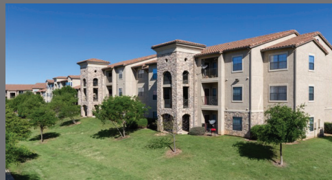
Costa Bella - San Antonio, TX