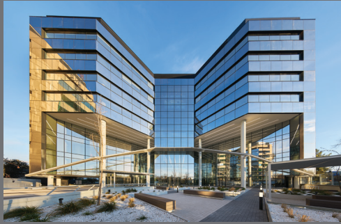
Costa Brava - Madrid, Spain