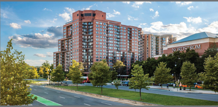
Park at Pentagon Row - Arlington, VA