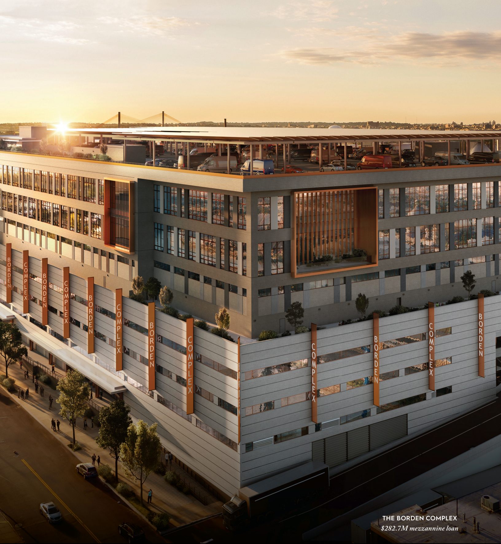
THE BORDEN COMPLEX $282.7M mezzanine loan