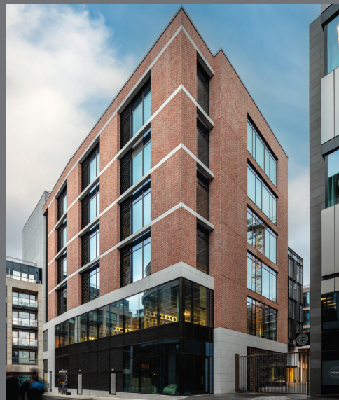
One Le Pole Square - Dublin, Ireland