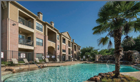
Mission Eagle Pointe - Allen, TX