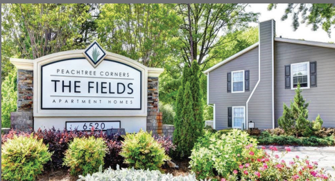
Fields at Peachtree Corners - Norcross, GA