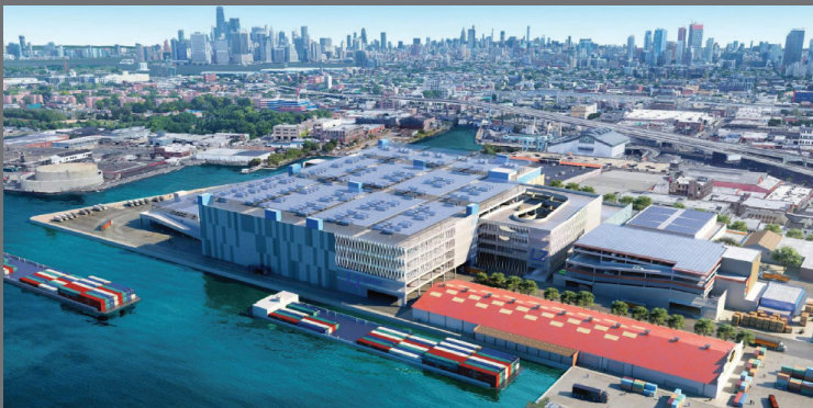
Sunset Industrial Park - Brooklyn, NY