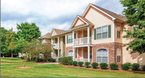
Village at Almand Creek - Conyers, GA