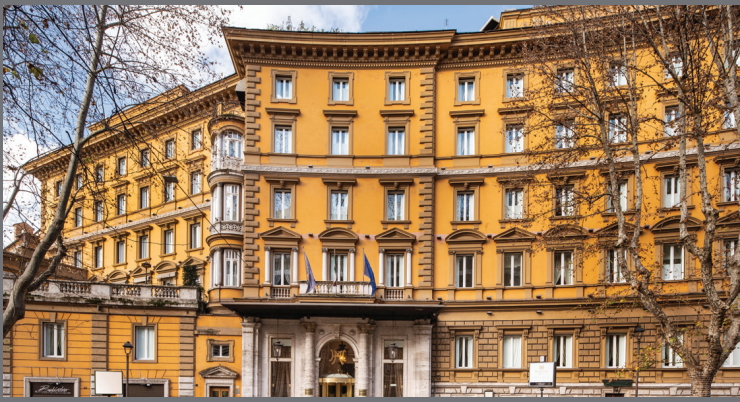
Baccarat Hotel Rome - Rome, Italy