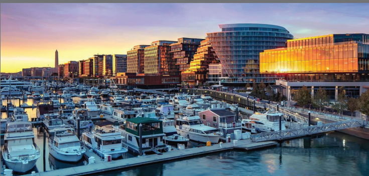
The Wharf - Washington, DC