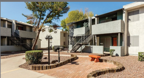
Portola North Phoenix - Phoenix, AZ