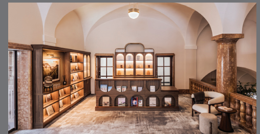
Arenas - Arosa, Switzerland