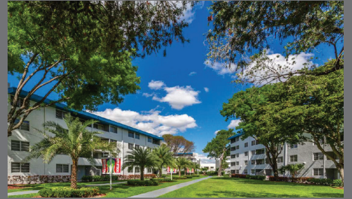
Art 88 - Miami, FL