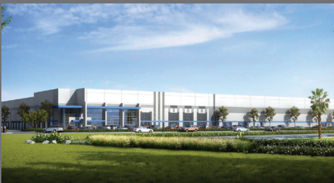
Sherwin Williams - Statesville, NC