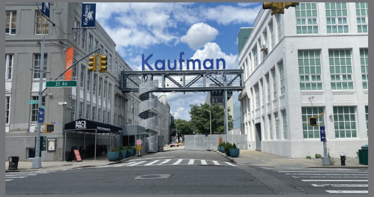
Kaufman Astoria Studios - Astoria, NY