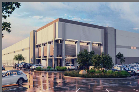
Wilmer Industrial - Wilmer, TX