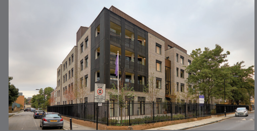
Country Court Care Homes - London, U.K.