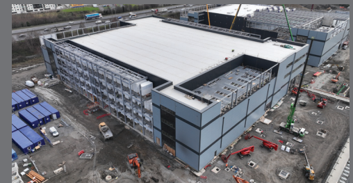
Echelon Data Centres - Clondalkin, Ireland