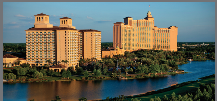
Grande Lakes Orlando - Orlando, FL