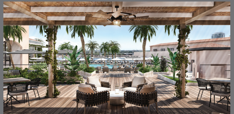
The Vinoy® Renaissance St. Petersburg Resort & Golf Club - St. Petersburg, FL