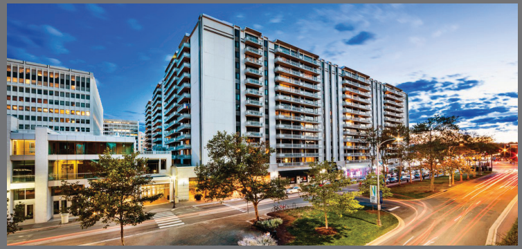
The Buchanan - Arlington, VA