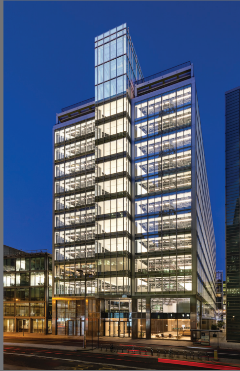
280 Bishopgate - London, U.K.