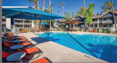
The Julia - Mesa, AZ