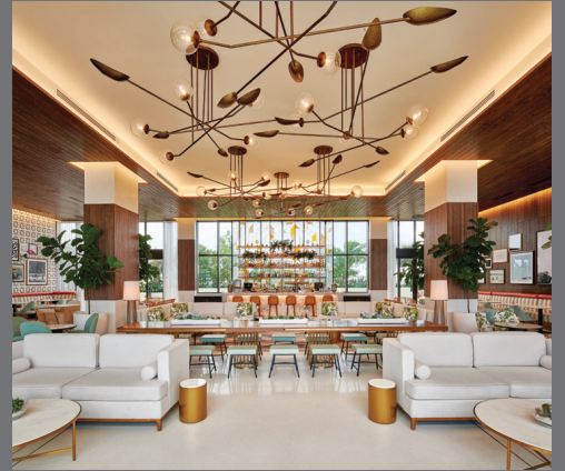
The Dalmar and Element - Fort Lauderdale, FL