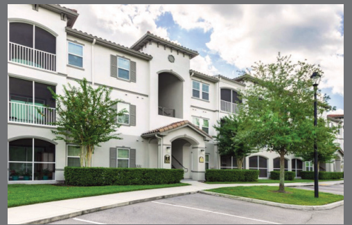
Casa Mirella - Windermere, FL