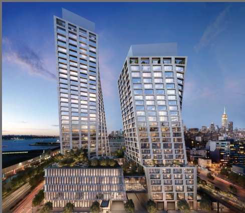
One High Line - New York, NY