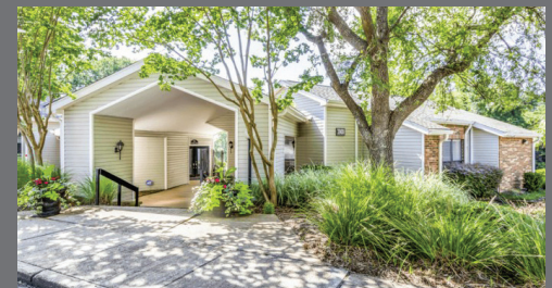
Landmark at Pine Court - Columbia, SC