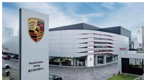
嘉興保時捷中心 Porsche Centre Jiaxing