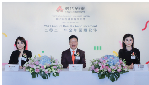
2021年年度業績發佈會 2021 Annual Results Presentation Conference