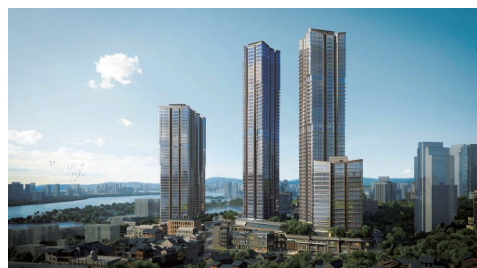
國浩 • 18T Guoco 18T Mansion