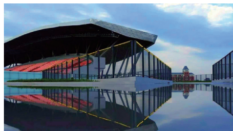
肇慶新區體育中心 Zhaoqing New District Sports Center