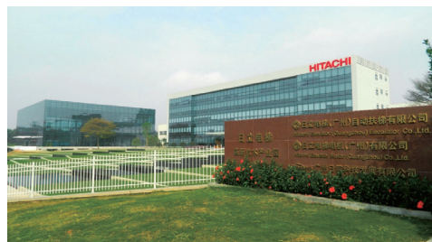
日立電梯高新技術產業園 Hitachi Elevator Hi-tech Industrial Park