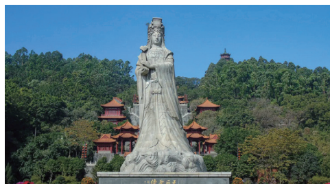
廣州南沙天后宮 Guangzhou Nanshan Tianhou Palace