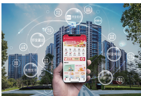
鄰里邦APP Neighborhood Services APP