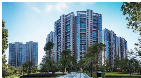
時代外灘 Times Bund