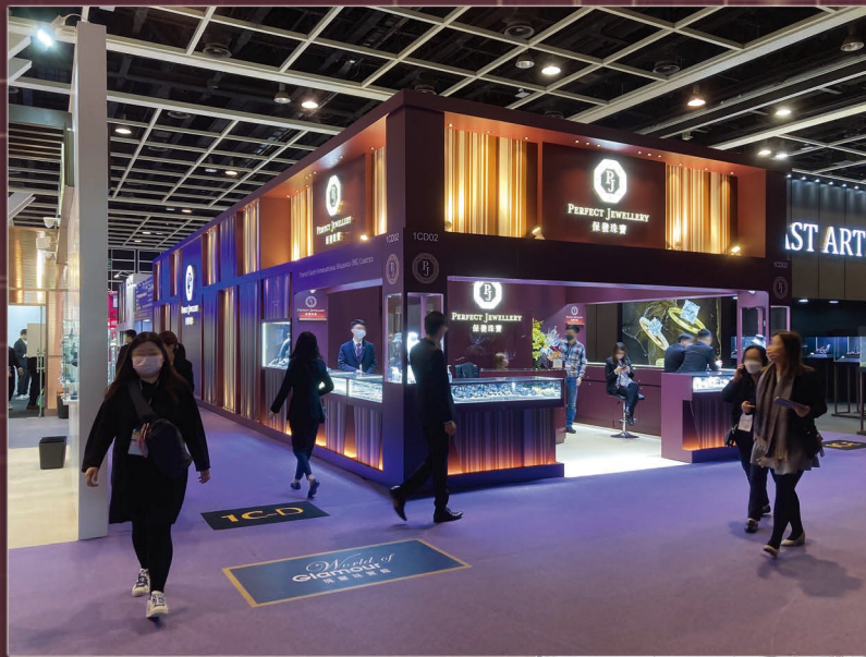
香港國際珠寶展 HONG KONG INTERNATIONAL JEWELLERY SHOW