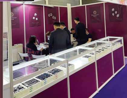
環球盛事 | 新加坡珠寶首飾展覽會 JEWELLERY & GEM WORLD SINGAPORE