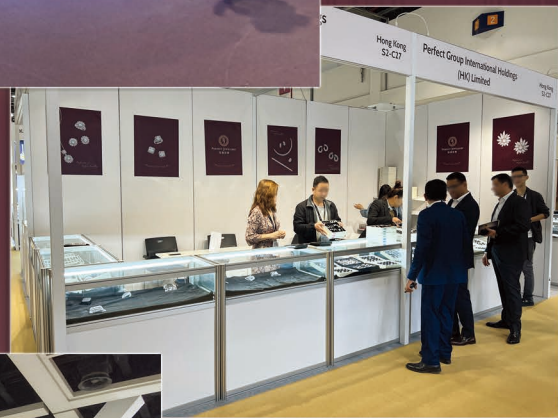
JGT 迪拜珠寶展 JGT DUBAI JEWELLERY SHOW