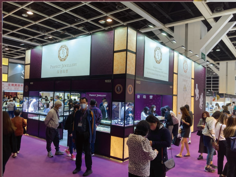
JMA 香港國際珠寶節 JMA HONG KONG INTERNATIONAL JEWELRY SHOW