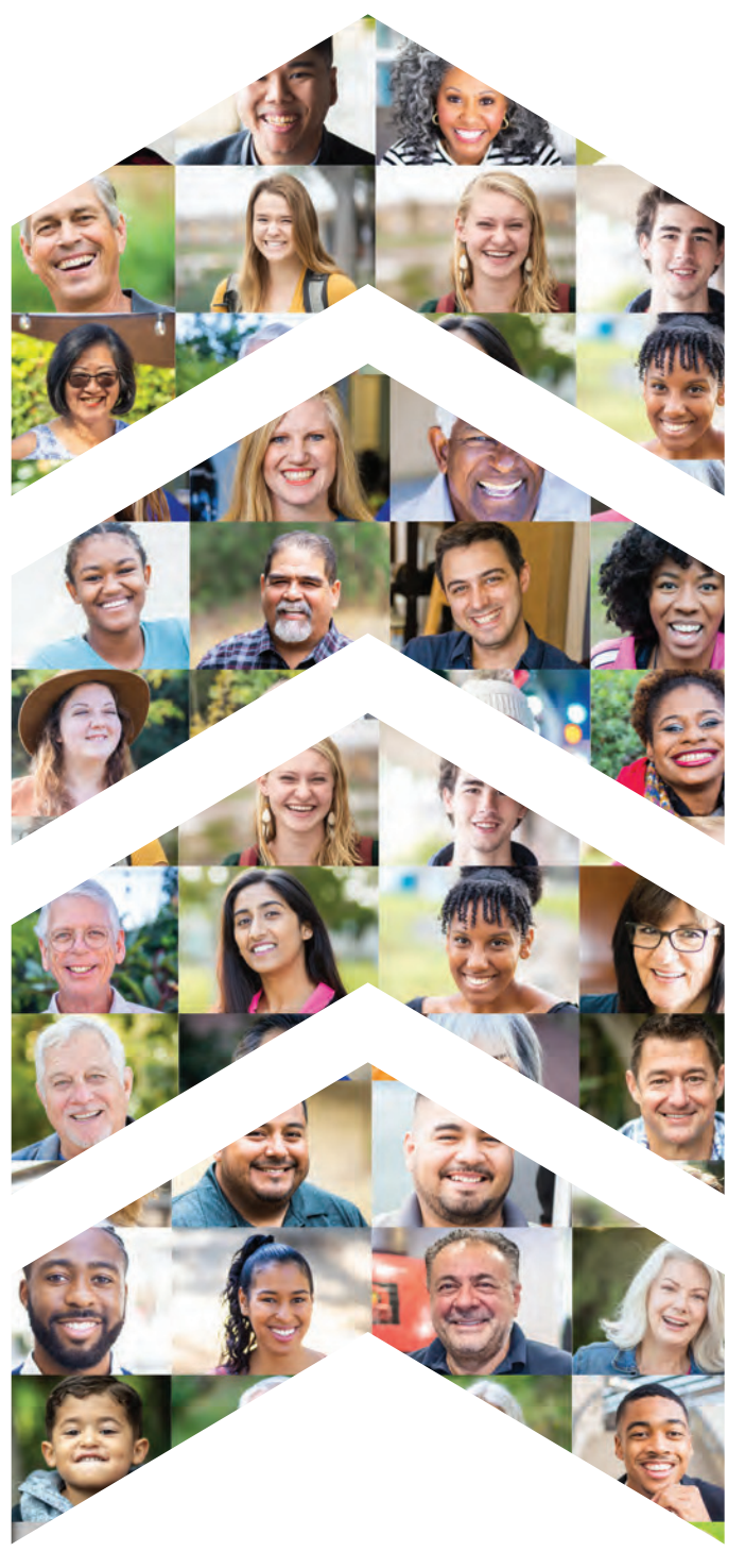
ANNUAL REPORT 2022