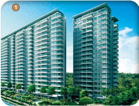
1. Dakota Residences