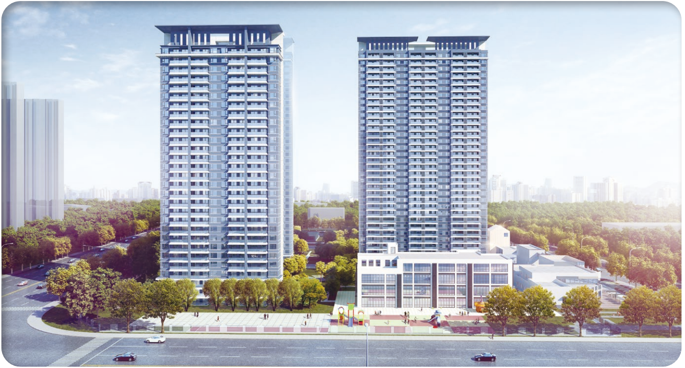
Zhengzhou Zensun Ecological City (No.7 Garden) 鄭州正商生態城七號院

For the financial year ended 31 December 2022, the Group's revenue and gross profit amounted to approximately RMB9,657.1 million and approximately RMB827.0 million, representing a decrease of approximately 28.0% and a decrease of approximately 34.5% respectively compared with that of the corresponding period of 2021, which were primarily derived from the property development business in the PRC. The decrease in revenue was mainly contributed by combination of less delivery of saleable/ leasable GFA and lower average selling price ("ASP") from the delivery of the Group's completed property development projects during the Year as compared to 2021. The decrease in gross profit during the Year as compared to 2021 was resulted from the recognition of certain lower profit margin property projects during the Year, which was caused by property projects leading to had a higher unexpected construction cost due to the COVID-19 pandemic which prolonged development progress and property projects, together with suppressed selling prices under the decreasing public purchasing desires and power derived from aggregated unfavourable factors including the recurrence of the COVID-19 pandemic, the macroeconomic downturn and the continued depletion of demand in real estate properties.