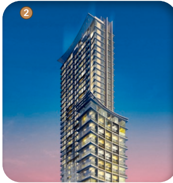
2&3. Southbank Soho