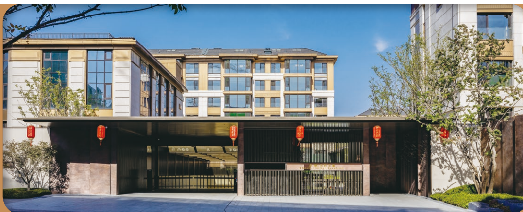
Zhengzhou Zensun Longshuishangjing 鄭州正商瓏水上境

Zensun Enterprises Limited (the “Company”) was founded in 1965 and listed on the Main board of The Stock Exchange of Hong Kong Limited (“Stock Exchange”) since 1972. The Company has been included as a constituent for the MSCI Hong Kong Small Cap Index in May 2021 and as a constituent for the Hang Seng Composite Index in March 2022 respectively. The Company and its subsidiaries (collectively, the “Group”) primarily engages in property development, property investment, project management and sale services, hotel operations and securities trading and investment in Hong Kong, The People’s Republic of China (the “PRC”) and overseas.