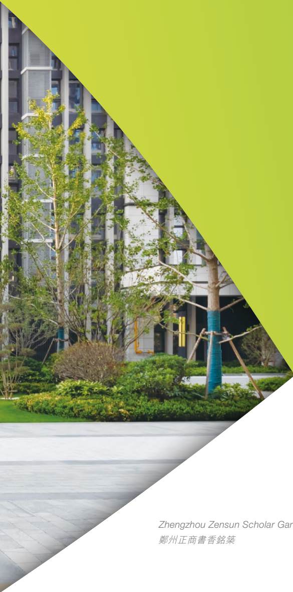
Zhengzhou Zensun Scholar Garden 鄭州正商書香銘築