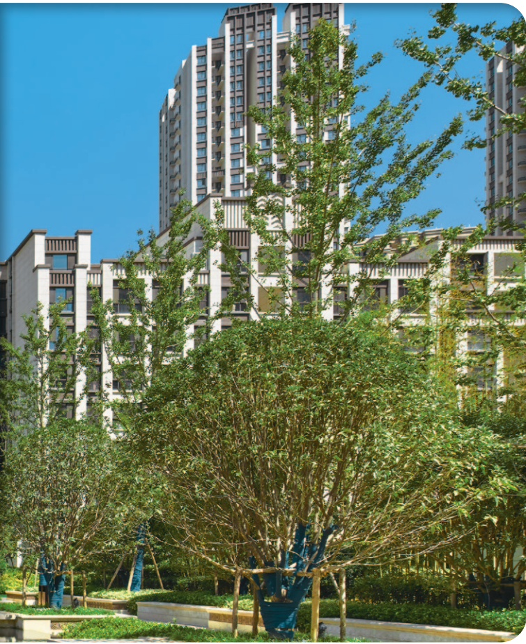
Zhengzhou Zensun Golden Mile House 鄭州正商金域世家