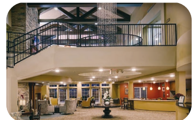
1&2. Glen Carr House, senior housing community