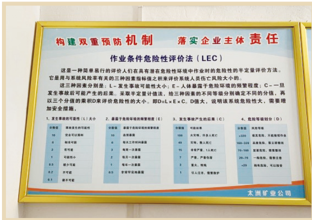
Method of Risk Assessment for Operation Conditions in Mines 於礦山的作業條件危險評價辦法