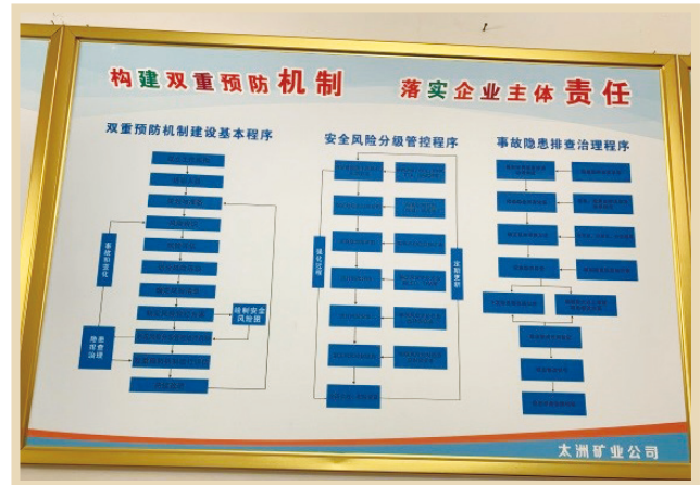
Procedures on Accident Prevention, Safety Risk Classification and the Screening, Identification and Control of Accident Hazards in Mines 於礦山的事故預防、安全風險分級及事故隱患排查治理程序

The Group has been very conscious in protecting the health and well-being of its staff during the COVID-19 epidemic. The Group has kept on full compliance with the government control measures both in the Mainland and Hong Kong. Staff has been supplied with necessary personal protective equipment and to the extent possible adopted flexible work hours and home office arrangement.