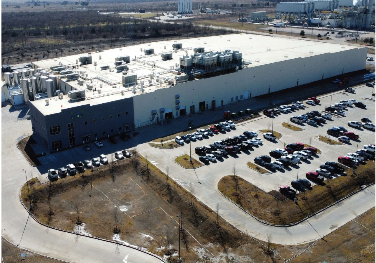
Mega facility in Midlothian, Texas