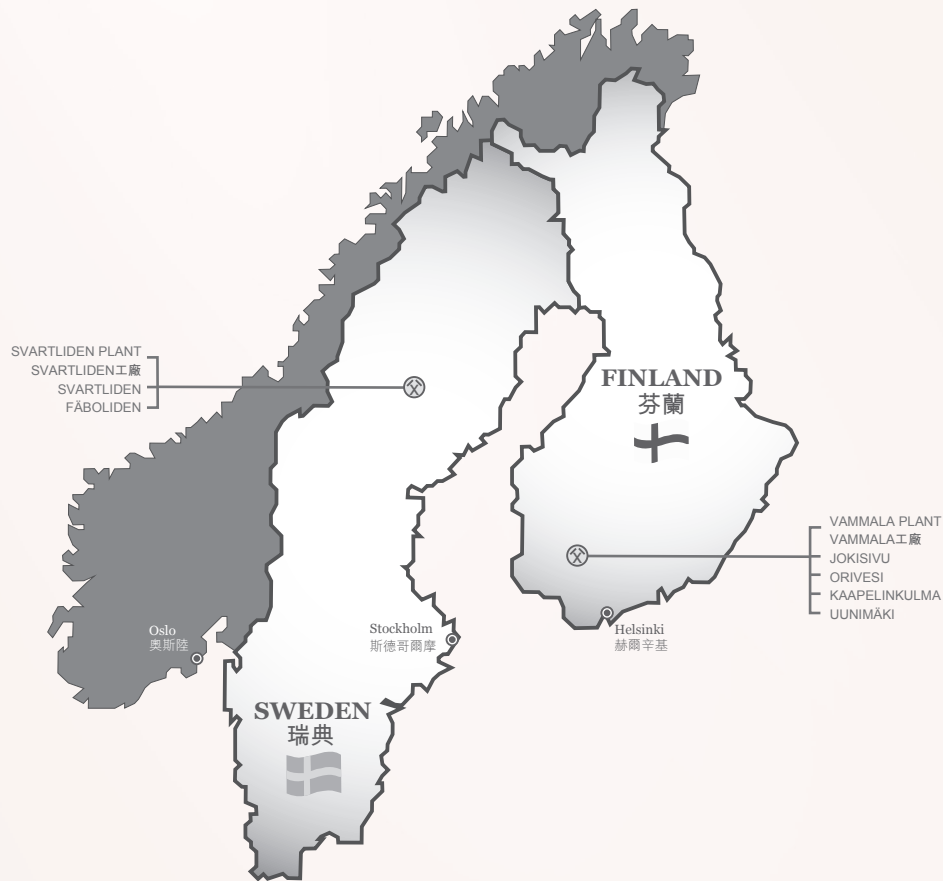
Project Location 項目地點

龍資源是一家發展成熟的黃金生產商，在瑞典及芬蘭擁有具前景的項目組合。自2000年首次進入北歐地區以來，本公司成功地將一系列露天和地下金礦投入運營，生產超過800,000盎司黃金。此乃通過本公司不斷致力於積極探索其持有的項目而實現，以保持及提高本公司的產量。