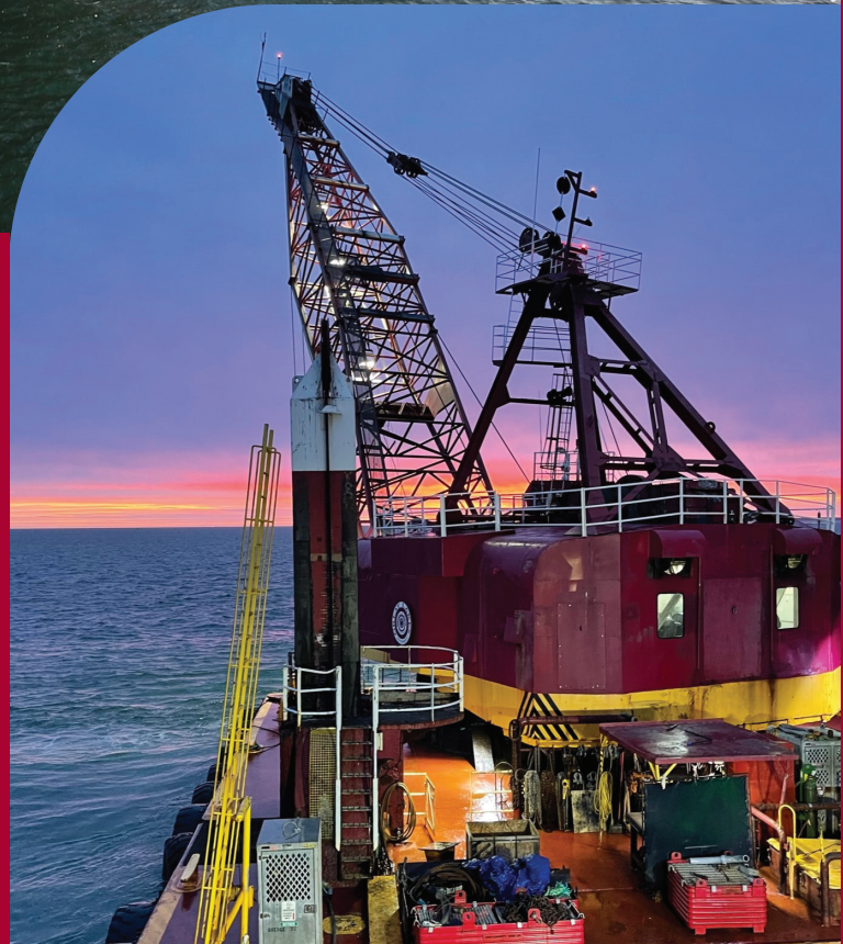
RIGHT: Clamshell Dredge 55 working for the Virginia Port Authority to deepen and widen the Thimble Shoal Federal Navigation Channel.