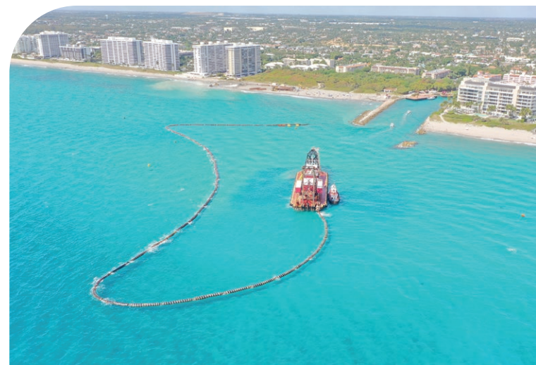
Cutter Dredge Alaska pumping beneficial use dredged material to Boca Raton, Florida, during maintenance dredging for the City of Boca Raton, City of Deerfield Beach, and Town of Hillsboro Beach, Florida.