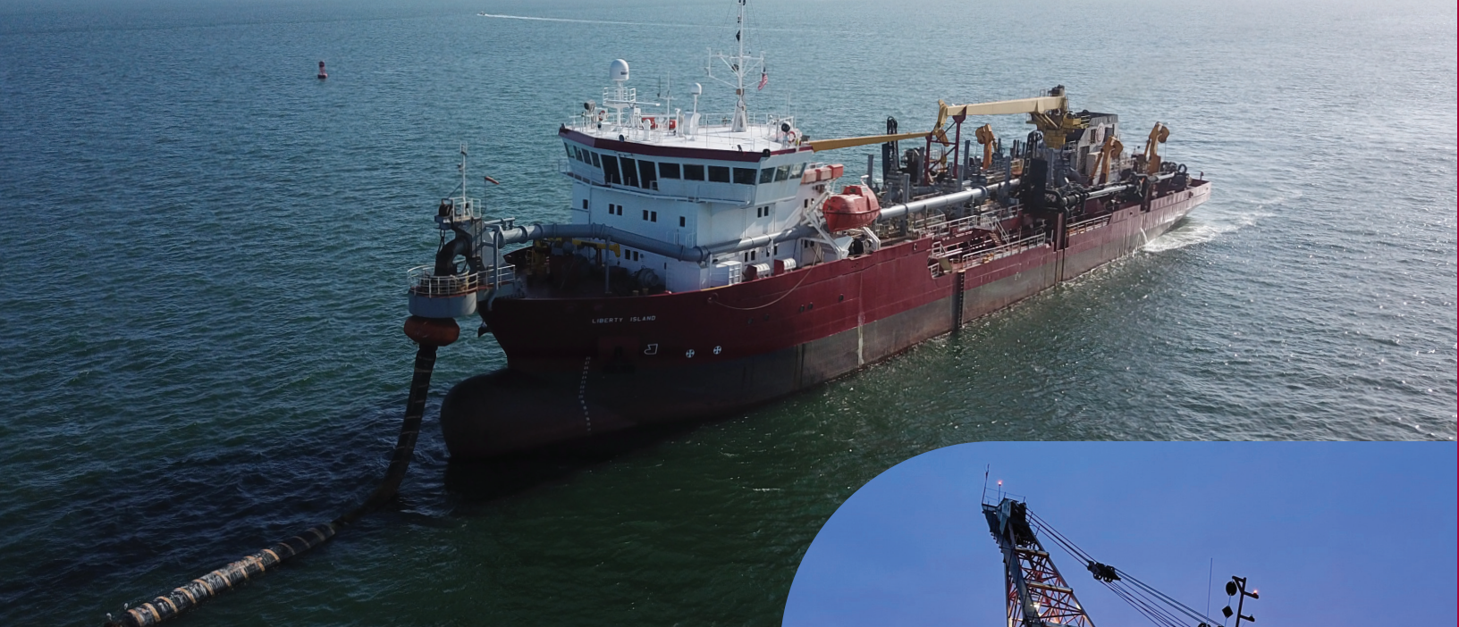
TOP: West Beach in Gulf Shores. Gulf Shores Beach Restoration, Alabama.