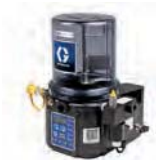
Grease Jockey with Telematics