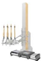
Synchronizing Axis YT05