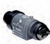
Stellair Auto Air Spray Gun