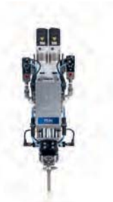
PR-Xv Variable Ratio Solution