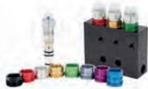
GCI Series Cartridge Injector