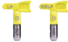
RAC X Low Pressure SwitchTips