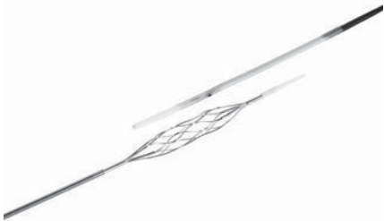
LimFlow ARC and V-Ceiver