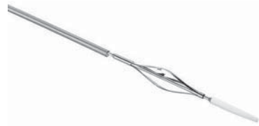
LimFlow Vector (Valvulotome)

Three of the components of the LimFlow system - ARC, V-Ceiver, and Vector - are each independently 510(k) cleared. The LimFlow ARC is a single-use device designed to facilitate placement and positioning of guide wires within the peripheral vasculature. The LimFlow ARC is intended to facilitate placement and positioning of guidewires and catheters within the peripheral vasculature. The LimFlow ARC is not intended for use in the coronary or cerebral vasculature. The LimFlow V-Ceiver consists of an intravascular catheter which incorporates a nitinol basket at its distal tip. The LimFlow V-Ceiver™ is intended for use in the cardiovascular system to manipulate and retrieve guidewires. The LimFlow Vector is a single-use medical device designed to cut venous valves during vascular in-situ bypass procedures. The LimFlow Vector is intended for the treatment of vascular disorders and more particularly for existing or disrupting venous valves.