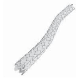
LimFlow Crossing Stents