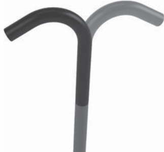
Trievers16 Curve Catheter