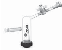
FlowSaver Blood Return System