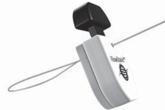
FlowStasis Suture Retention Device