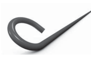
Trievers20 Curve Catheter