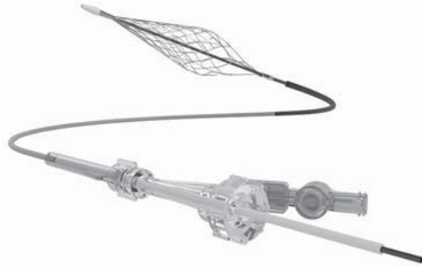
InThrill Catheter and Sheath

The InThrill system was purpose-built to treat small vessel thrombosis. The InThrill system is 510(k) cleared for the non-surgical removal of emboli and thrombi from blood vessels, and the injection, infusion, and/or aspiration of contrast media and other fluids into or from a blood vessel, and is intended for use in the peripheral vasculature but not intended for use in DVT treatment. We began commercializing the InThrill system in late 2022. Each component is packaged separately and sold individually.