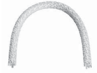
LimFlow Extension Covered Stent