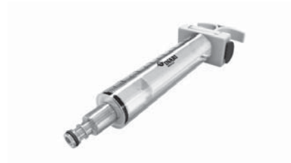
Large Bore Syringe and Whoosh Mechanism