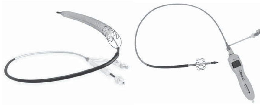
ClotTriever Bold Catheter