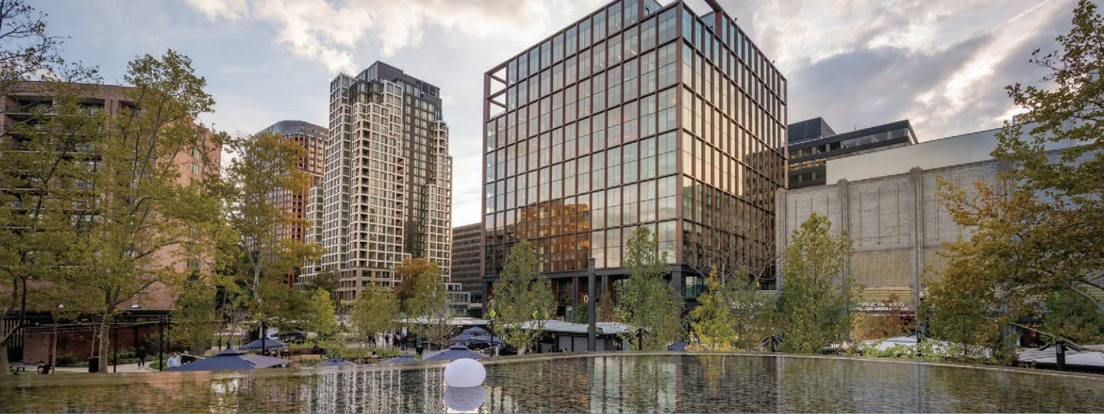
View from Water Park