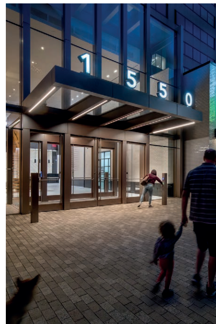
1550 Crystal Drive (commercial asset)

"Nearly 70% of CBRE's top lease transactions in Northern Virginia in the fourth quarter occurred in National Landing."