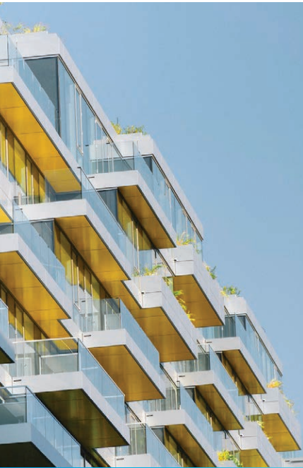
West Half (multifamily asset)

“Our 2024 prospect pipeline is stronger than it has been in years and, thus far, would indicate a potential increase in new leasing activity, but it is too early to tell how much of these vacates will be backfilled.”