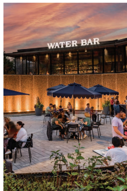
Water Bar at Water Park

We believe our placemaking interventions, the delivery of Amazon's new headquarters, and Amazon's continued return to the office will drive demand in the lease-up of 1900 Crystal Drive – two residential towers in the heart of National Landing totaling 808 units – which began leasing in January 2024. Move-ins commenced this month, and we are seeing healthy levels of interest thus far, illustrated by a leasing pace that exceeds all five of our multifamily deliveries since 2017. With this asset's completion, the soon-to-follow delivery of 2000/2001 South Bell Street and recent asset sales, our transition to majority multifamily is almost complete.