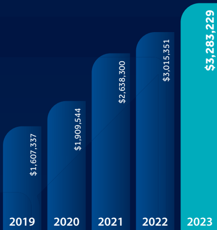
TOTAL ASSETS IN THOUSANDS