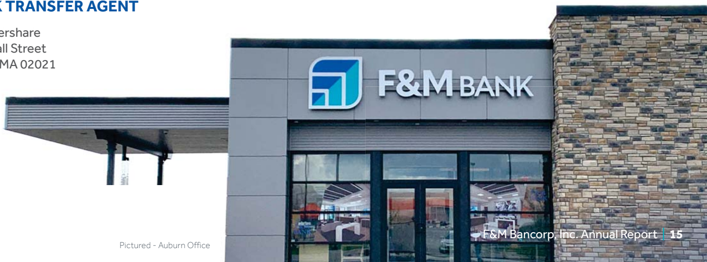
Pictured - Auburn Office

Raymond James Financial, Inc. 222 S. Riverside Plaza, 7th Floor Chicago, IL 60606 Ph: 800.800.4693