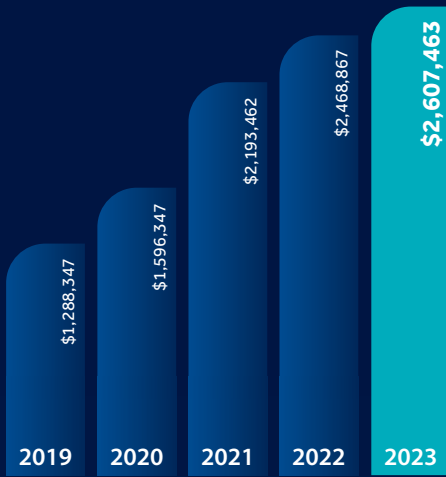
TOTAL DEPOSITS IN THOUSANDS

In 2023, F&M Bank continued to demonstrate its commitment to financial excellence and community prosperity. Despite facing a challenging economic landscape, the bank achieved remarkable milestones, marked by growth and resilience. F&M Bank recorded substantial increases in key business line metrics, reaffirming its position as a trusted financial partner for individuals, businesses, and communities alike.