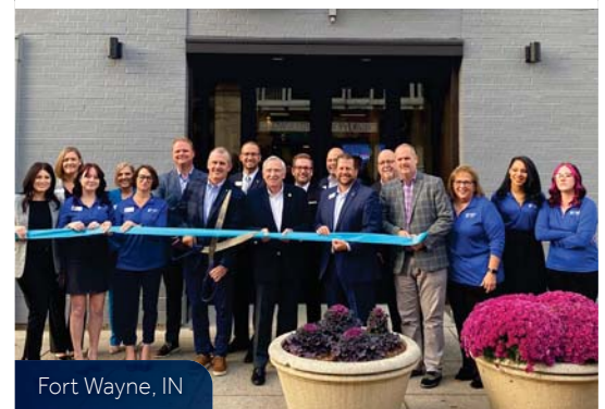
Fort Wayne, IN