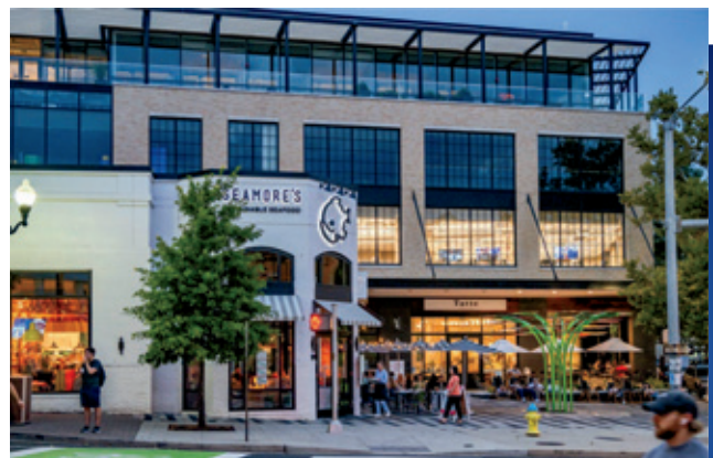
The Crossing Clarendon | Arlington, VA