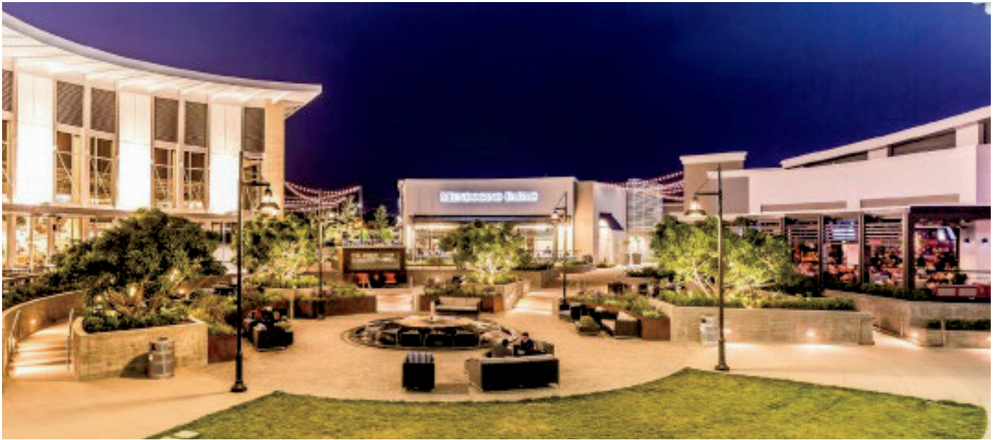
Village at La Floresta | Los Angeles, CA

Lastly, but importantly, Regency's success and accomplishments in 2023, and over the last 60 years, would not have been possible without the unwavering support of all our stakeholders. We are grateful for the continued commitment and engagement that our investors, tenants, joint venture partners, service providers, communities, Board of Directors and talented team have provided us over the last 60 years. We thank you for your loyalty and look forward to sharing many more years of success together.