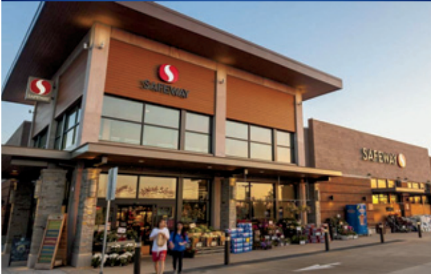
Grand Ridge Plaza | Issaquah, WA