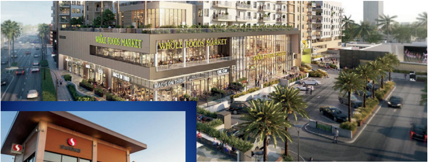
Bloom on Third | Los Angeles, CA