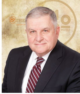
Gen. Anthony C. Zinni (USMC Retired) Director