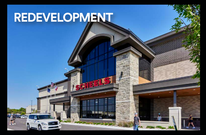
Towne East Square, Wichita, KS