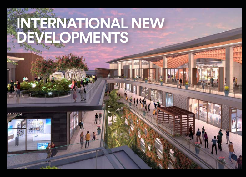
Jakarta Premium Outlets, Jakarta, Indonesia