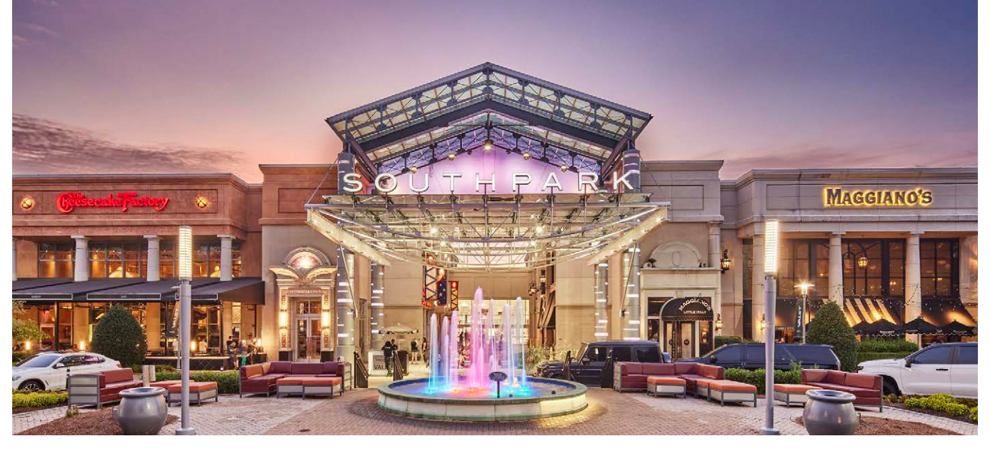
SouthPark, Charlotte, NC