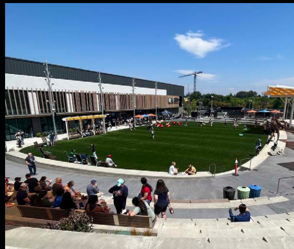
Northgate Station, Seattle, WA