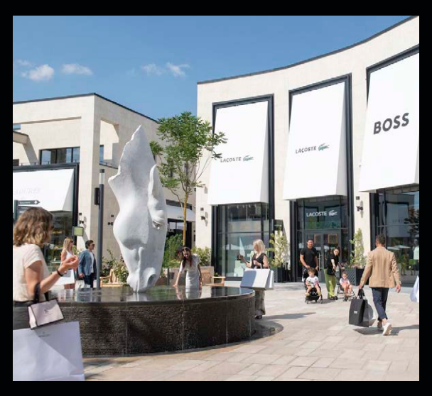
Paris-Giverny Designer Outlet, Vernon, France