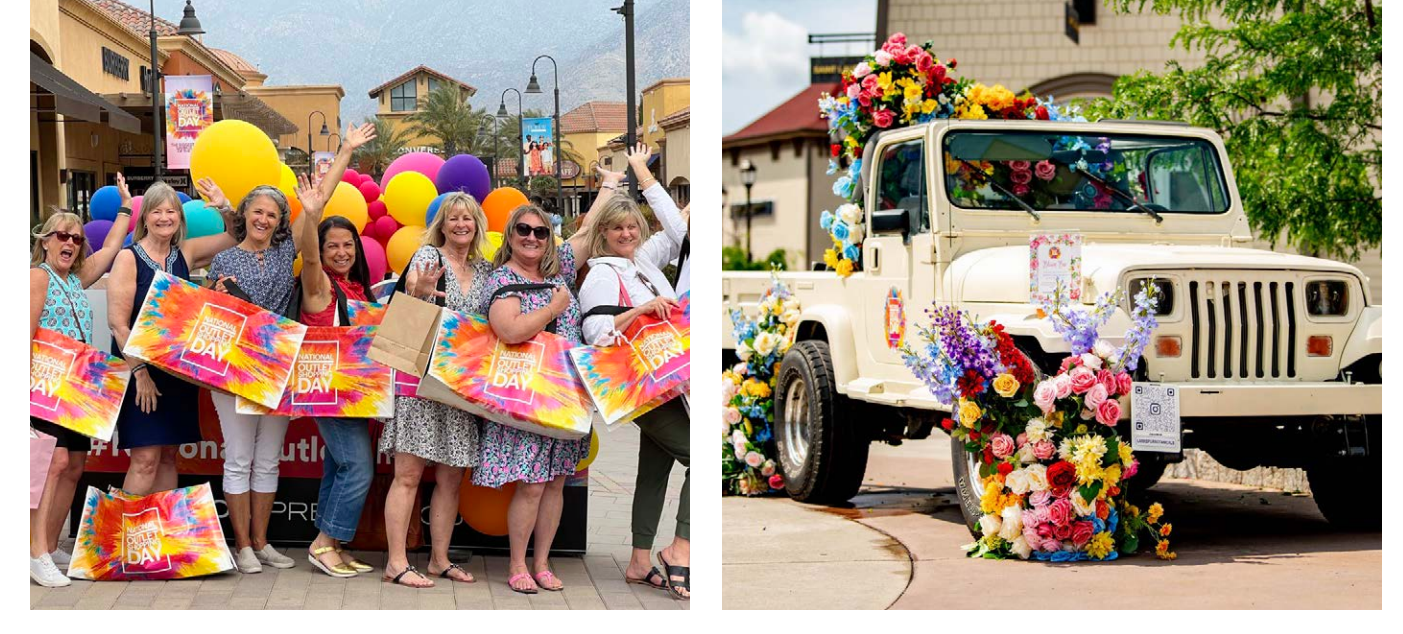
National Outlet Shopping Day