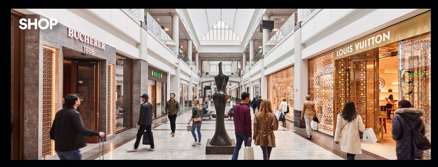
The Westchester, White Plains, NY