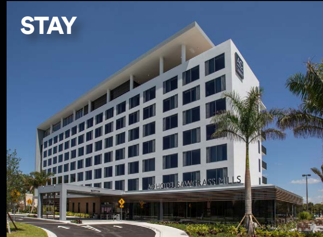
Sawgrass Mills, Sunrise, FL