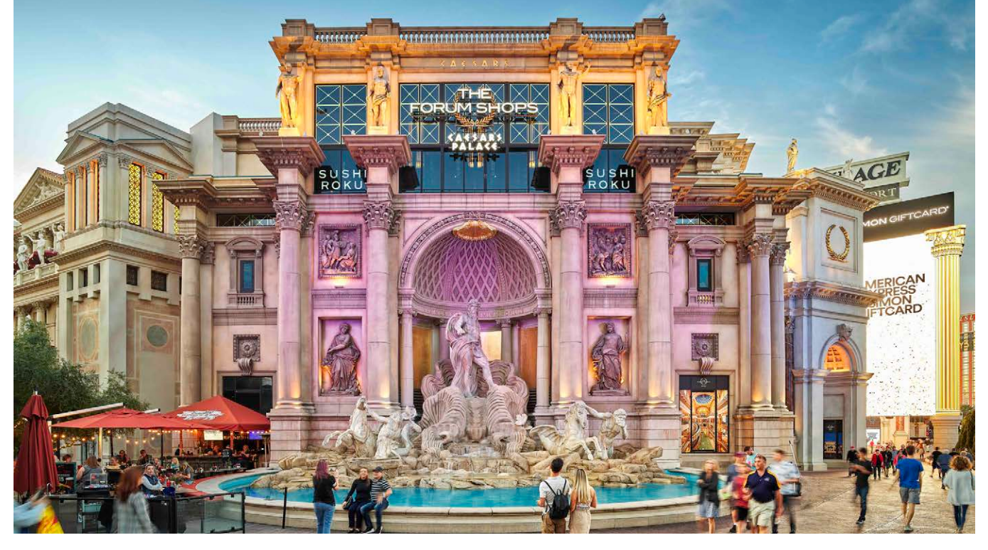
The Forum Shops at Caesars Palace, Las Vegas, NV

When you consistently grow over multiple decades, no matter the economic cycles or competition you face, you develop an understanding of your strengths and who you are. This understanding, coupled with our conviction, will fuel future growth. We continually set the bar higher as property owners and stewards of capital. This is not new, and after 30 years, it's fun to look back, at least momentarily; but more importantly, we are positioned to make our future even more prosperous.