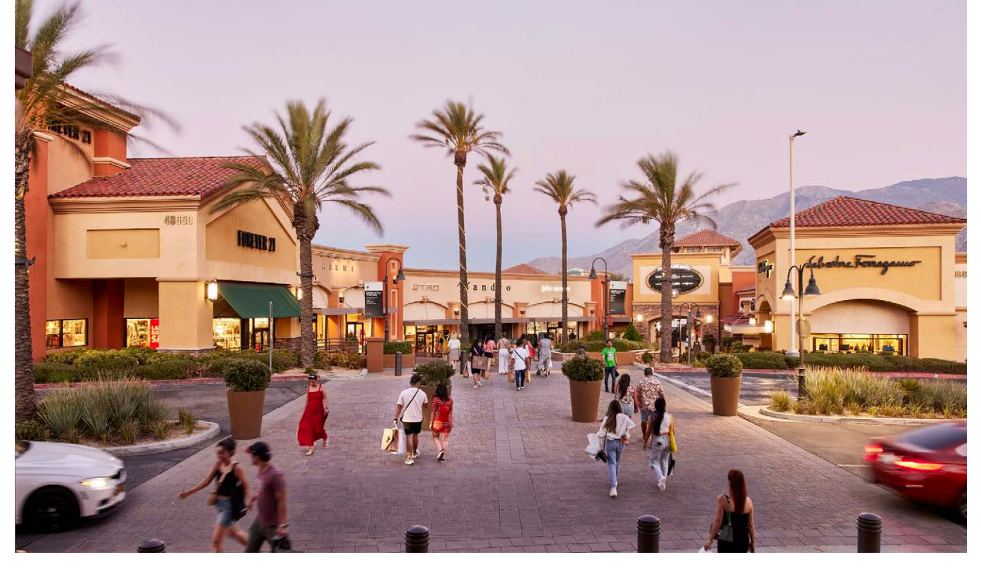
Desert Hills Premium Outlets, Cabazon, CA

Our diversified tenant mix is always changing and adapting, best illustrated by the fact that, compared to 30 years ago, only one retailer at that time is still a current top 10 tenant. Evolving retailers is the only constant and is not feared, but part of our everyday business as it allows us to meet the ever-changing demands of the consumer.