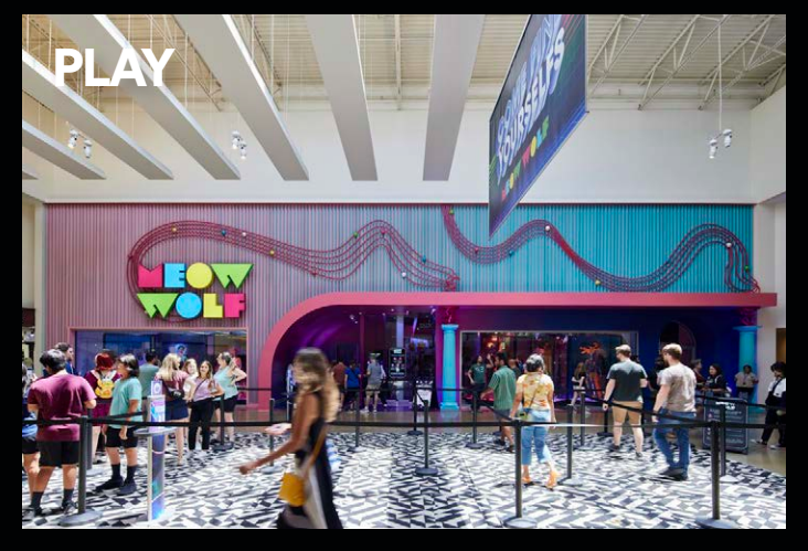
Grapevine Mills, Grapevine, TX