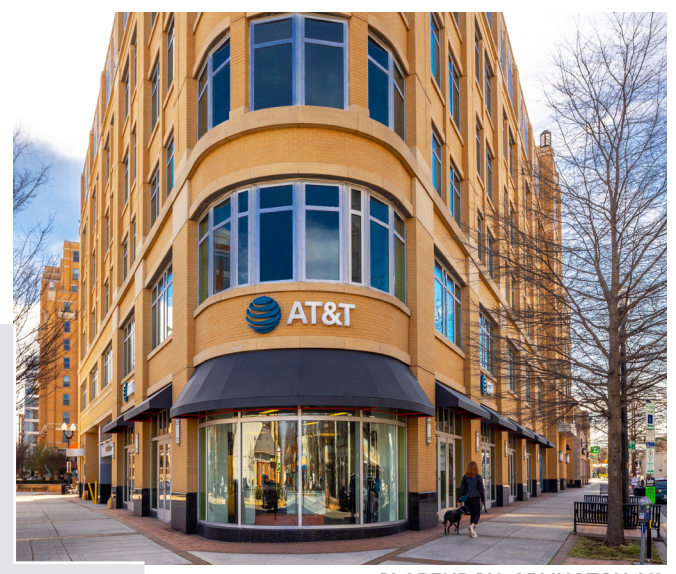
CLARENDON, ARLINGTON, VA

Where possible, we leverage land available at our existing shopping centers to add free-standing pad site buildings. In 2023, Shake Shack opened at a new 3,200 square foot pad site at Kentlands Square in Gaithersburg, Maryland, and Wendy's opened at a new 2,700 square foot pad site at Beacon Center in Alexandria, Virginia. We have executed leases or leases are under negotiation for five more to-be-developed pad sites.