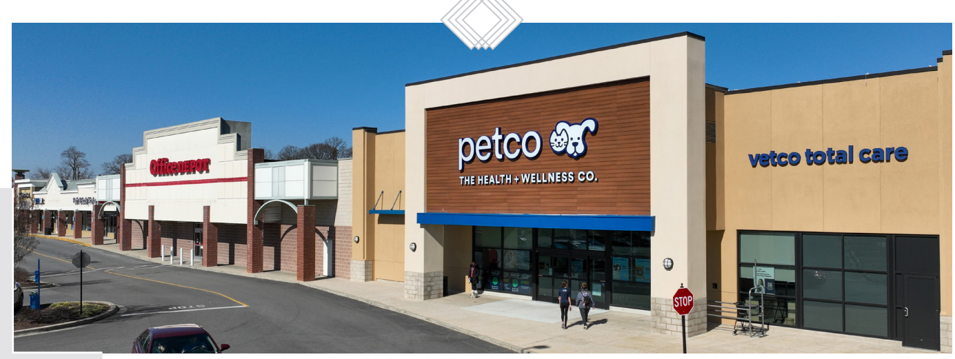
SEVERNA PARK MARKETPLACE, SEVERNA PARK, MD