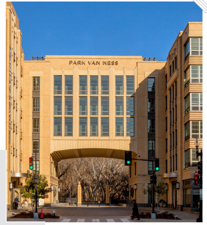
PARK VAN NESS, WASHINGTON, DC