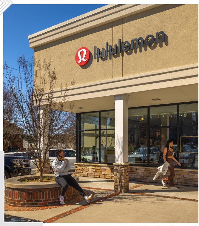
THRUWAY, WINSTON-SALEM, NC

House, respectively. Additionally, our dividend reinvestment plan supplements our borrowing availability and operating cash flow to ensure adequate liquidity.