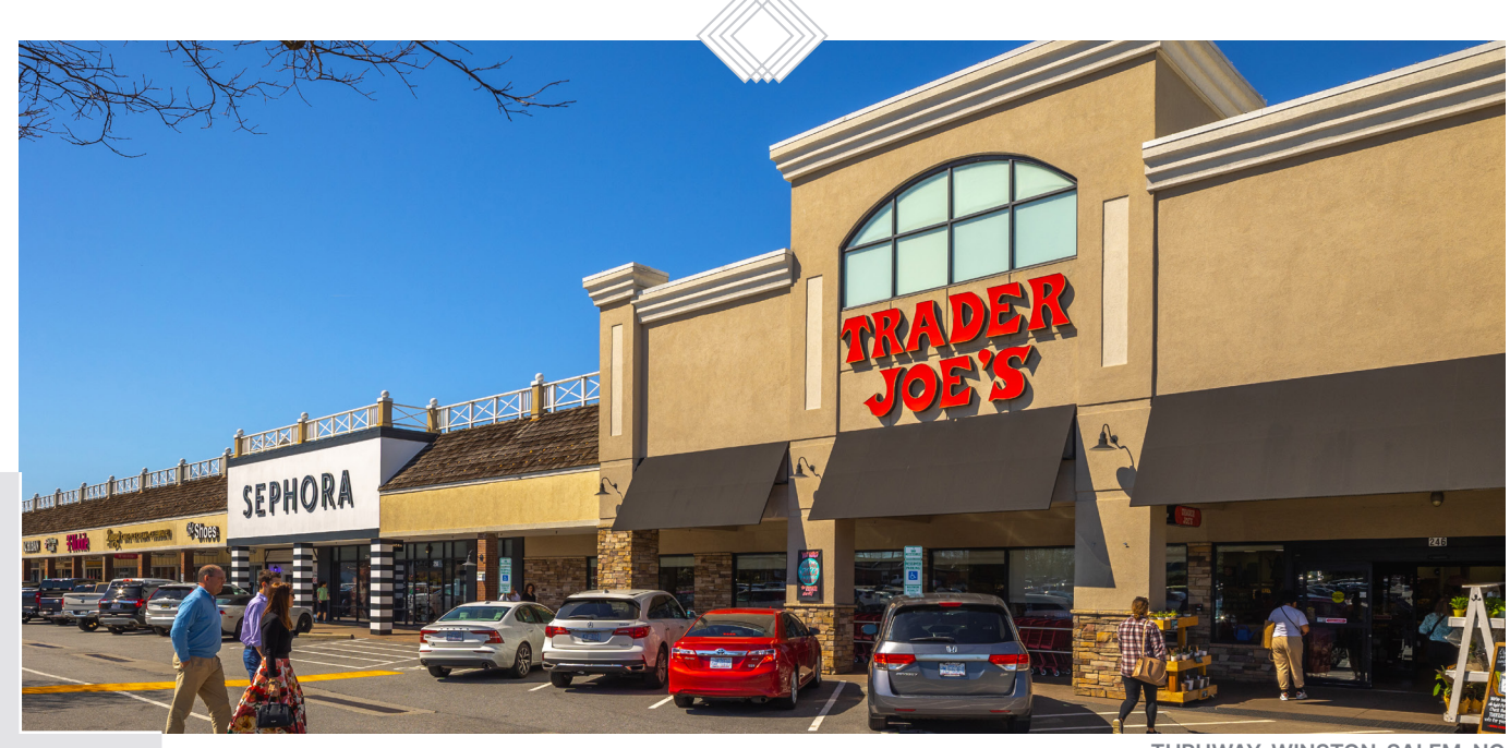
THRUWAY, WINSTON-SALEM, NC