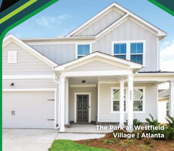
The Park at Westfield Village | Atlanta