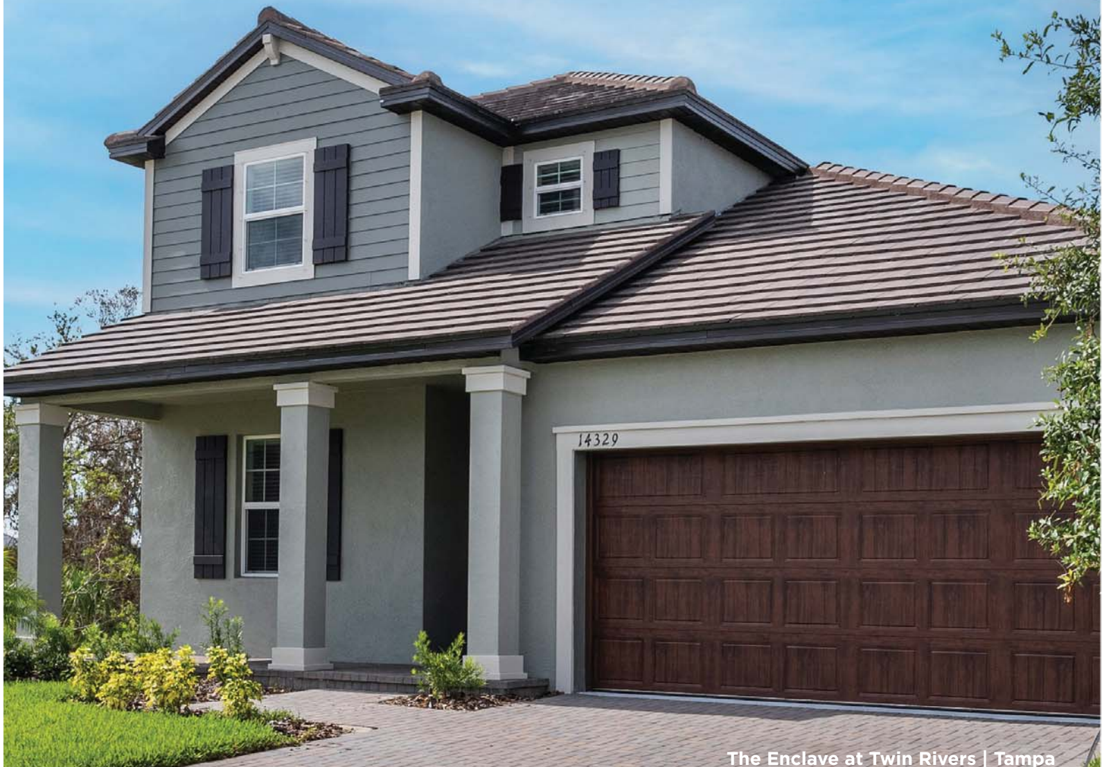
The Enclave at Twin Rivers | Tampa

Atlanta | Carolinas | Chicago | Dallas | Denver | Houston | Jacksonville | Las Vegas | Minneapolis Northern California | Orlando | Phoenix | South Florida | Southern California | Seattle | Tampa