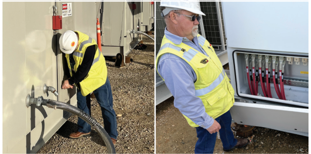
Below: The Phase III expansion of the Moss Landing Energy Storage Facility—made up of 122 individual containers that together house more than 110,000 battery modules—was completed in summer 2023 on schedule and within budget in just 16 months.