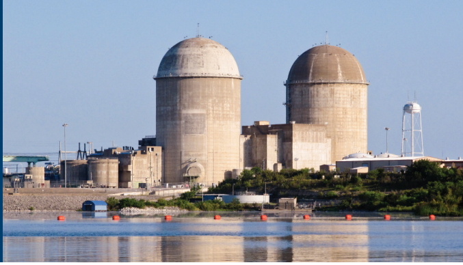
Vistra owns and operates the second-largest competitive nuclear power fleet in the U.S. Pictured: Vistra's Comanche Peak Nuclear Power Plant in Glen Rose, Texas, with ~2,400 MW of zero-carbon nuclear generation capacity.

In all, we concluded the year with $4.14 billion of Ongoing Operations Adjusted EBITDA, which was approximately $400 million higher than the midpoint of the original guidance range announced in November 2022. We also achieved $2.49 billion of Adjusted Free Cash Flow before Growth, exceeding the midpoint of the original guidance by $441 million.