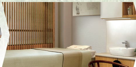
TDMall (Sydney) 悉尼天大館