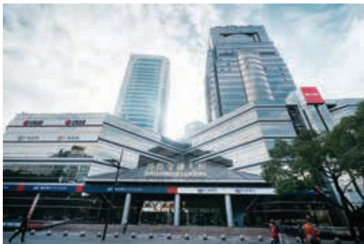
TOMSON COMMERCIAL BUILDING 湯臣金融大廈