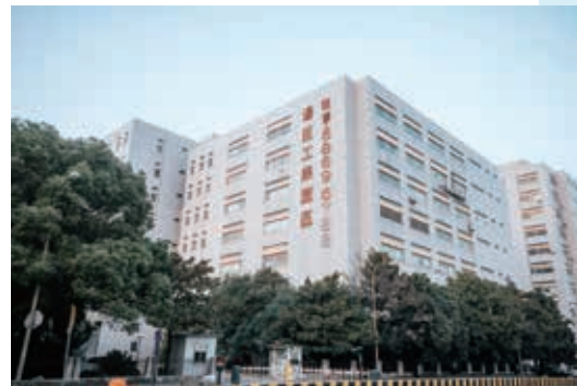
TOMSON WAIGAOQIAO INDUSTRIAL PARK 湯臣外高橋工業園區