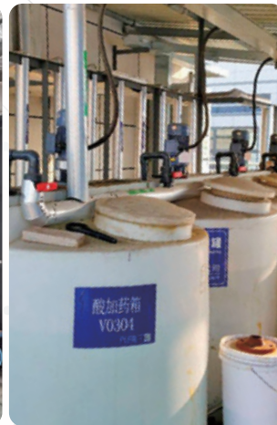
Sewage Treatment Facilities 廢水處理設施