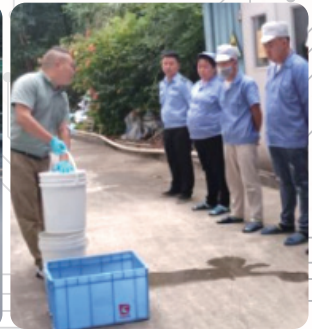
Safety Training and Drills 安全培訓與演練