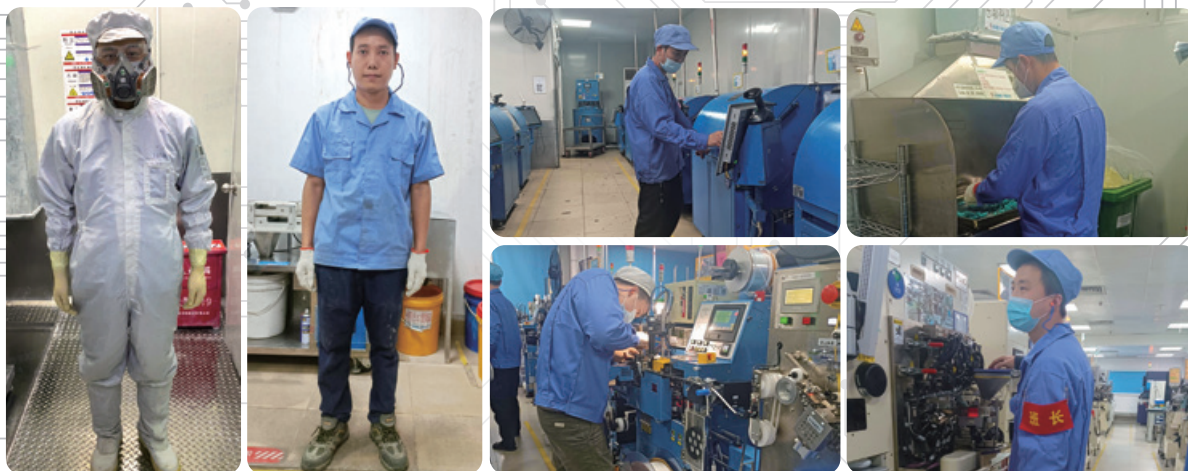
Safe Working Environment 安全工作環境

生產部門負責機器的安全檢查，並由符合資格的外部維修公司進行定期檢查。設備部於生產車間的當眼位置貼上安全隱患的警告標示，以提示員工工作場所的潛在危險（如化學、電器、火災、車輛、滑倒、絆倒和墜落的危險）。本集團還教育員工生產設備、安裝設備、消防設施、防護器材和急救工具的正確使用方法。設備部進行月度及季度安全檢查，為發現的安全隱患制定整改計劃及設定完成期限，並於安全生產例會中跟進有關整改工作，以保證設備處於良好及安全的生產狀態，例如：於安全檢查中，包裝部發現包裝箱堵住滅火器，員工可能因此於火災時未能及時找到消防設備等，包裝部已為此進行評估及跟進。本集團為員工提供符合國家規定的勞動安全衛生條件和必要的勞動保護用品，確保員工有足夠的防護措施下工作，減少工傷意外的發生。