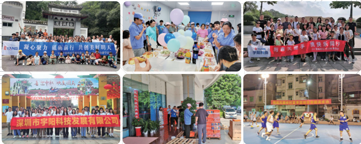
Staff Activities 員工活動與福利

本集團亦非常關注員工的身心健康，為員工組織活動，包括籃球比賽、團建活動、旅遊等，希望增強員工之間的凝聚力、提升員工的歸屬感和減輕員工的工作壓力。本集團還設有工會和員工代表，於每季度進行員工滿意度調查及作出相應的改進，並建立意見反映、投訴和申訴機制。