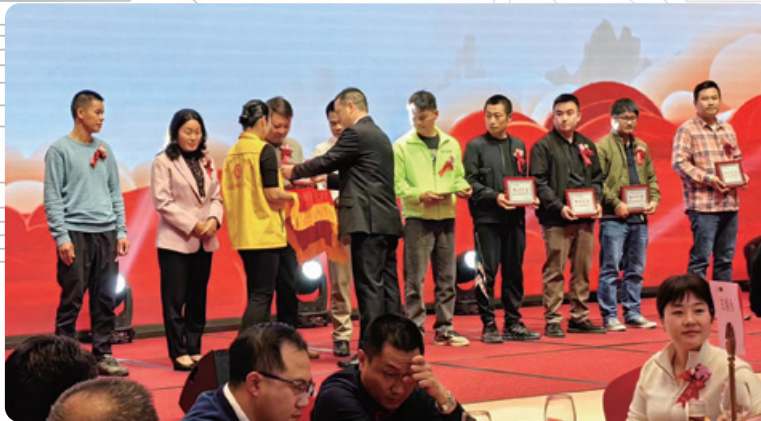
Condolences to Epidemic Prevention Personnel and Fire Brigade Activities

本集團深明責任無處不在，應當對自己負責、對家人負責、對企業負責、對社會負責，重視企業形象與社會責任，並以「以人為本、履行社會責任」的管理方針，積極追求回饋及貢獻社會。本集團向來依法經營納稅，不遺餘力地協助解決當地的就業壓力。本集團為員工好好計劃退休生活作準備，為國內業務員工繳納五險一金，香港業務員工參加強積金計劃。本集團一直保持良好的生產經營、積極推行綠色環保理念及營造良好的發展秩序，在保持社會穩定及建設和諧社區方面，有一定的貢獻。於報告期內，本集團捐贈人民幣8,000給鳳崗敬老院及梅州職業技術學院。本集團於「八一」建軍節慰問消防救援隊伍及捐贈物品。